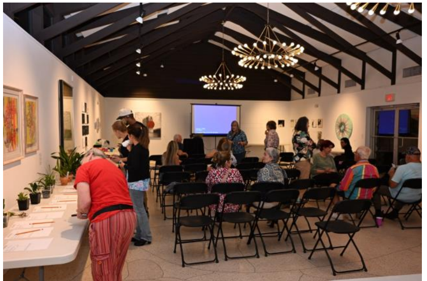
Lots of bargains on our Silent Auction Table!