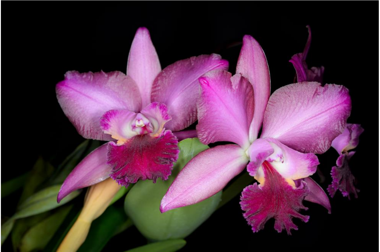
Rlc. Suncoast Raspberry Cooler - Aida Walchli