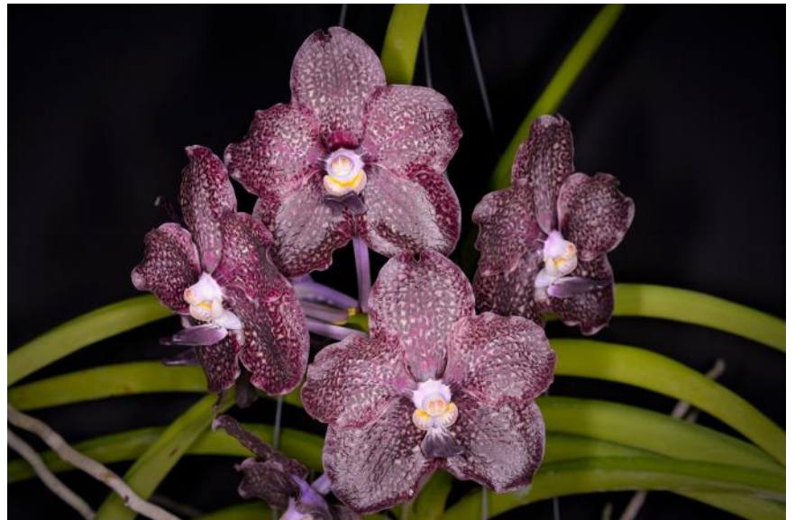
V. (Kultana Red x V. Mimi Palmer) Melissa Alatriza