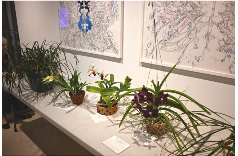
A small sampling of plants our members and friends brought for judging