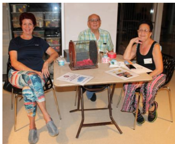
Some of our SFOS Volunteers hard at work!