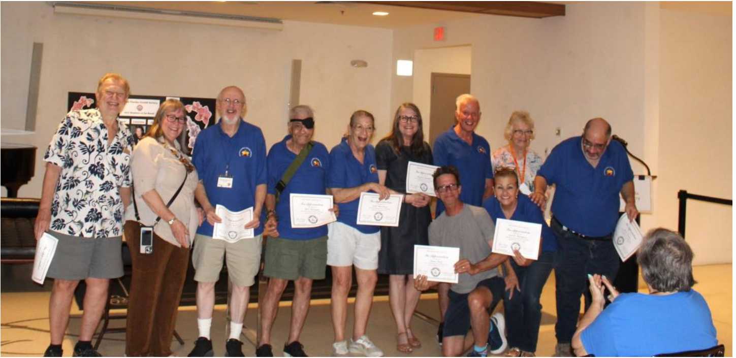
The South Florida Orchid Society Officers and Board of Directors