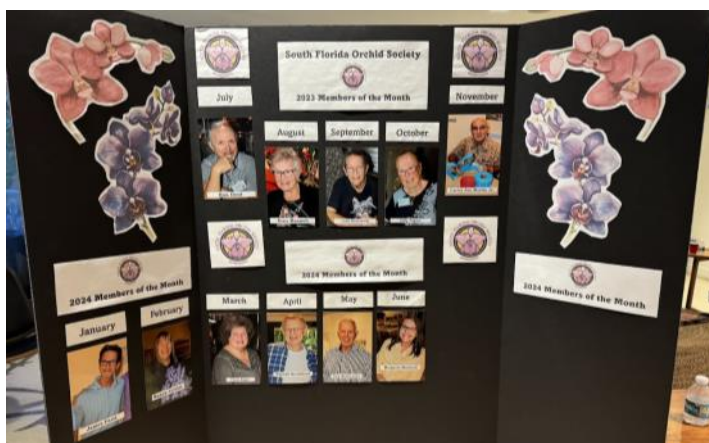
SFOS Members of the Month!