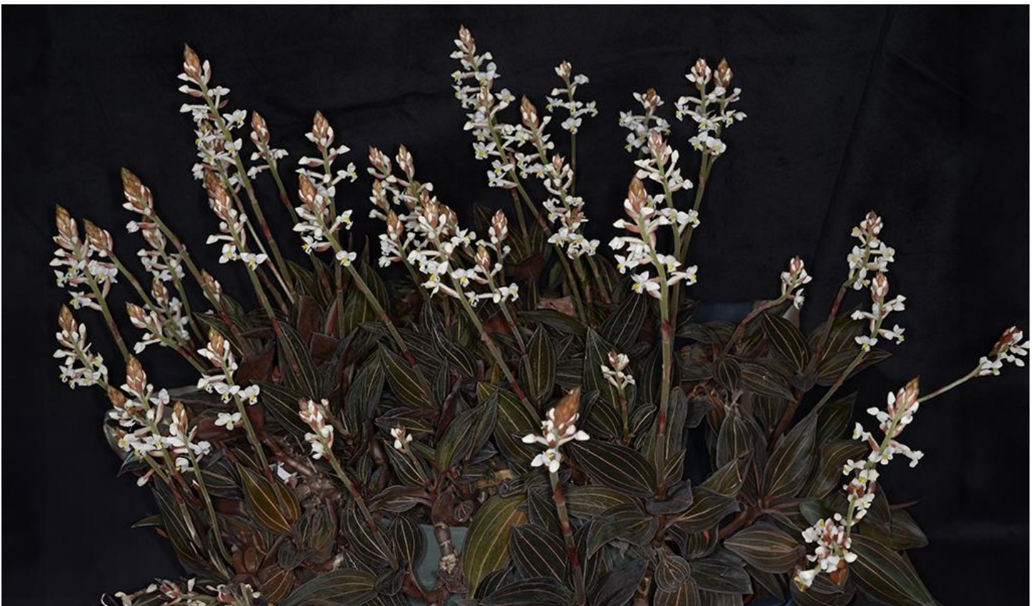
Ludisia discolor