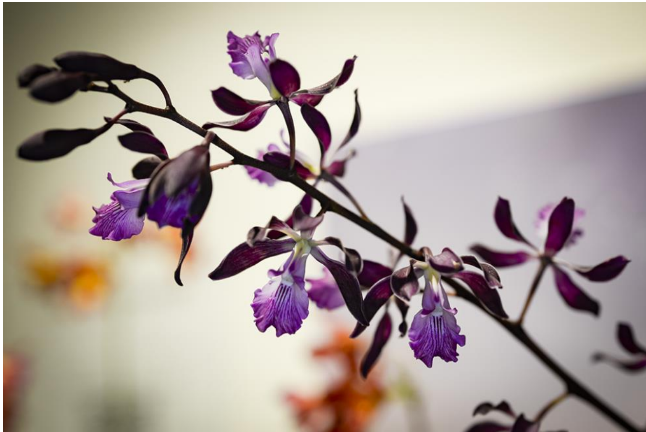
Enc. Paula Gross ( cordigera x flava)