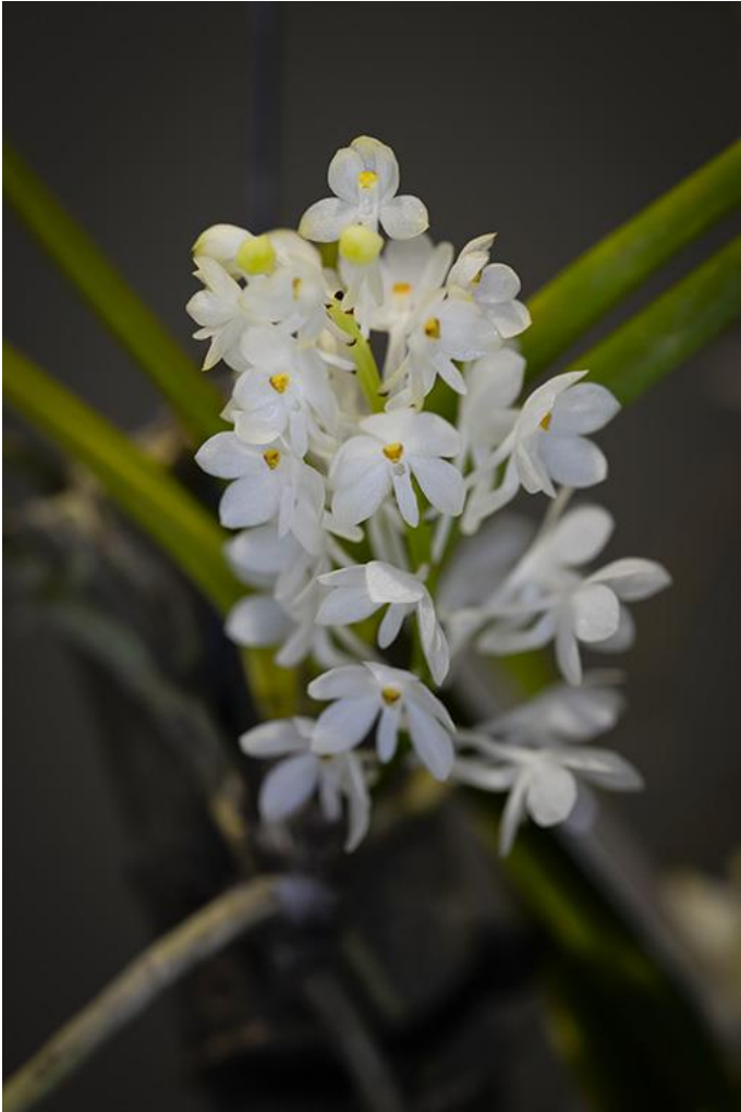
Asc. ampullacium alba - David Foster