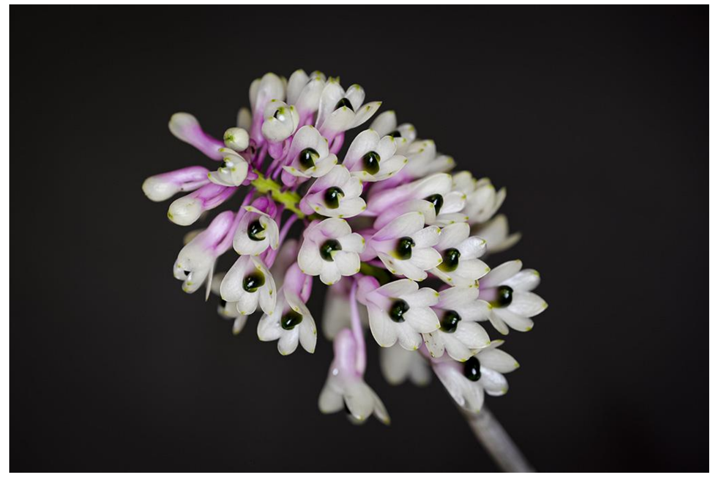
Den. smillieae