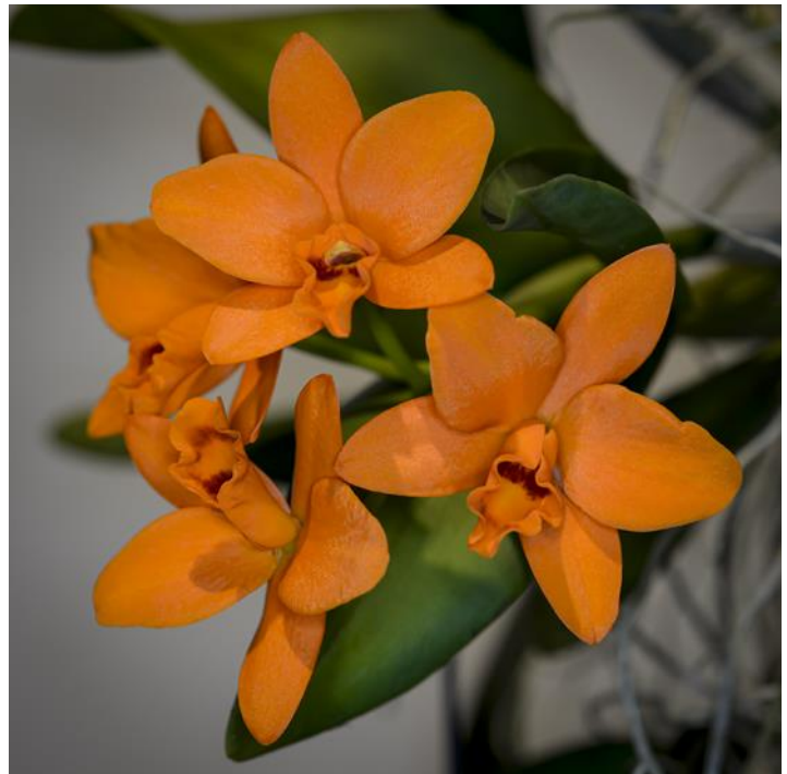
Pot. Shinfong Little Sun "Young-Min Golden Boy" James Furst