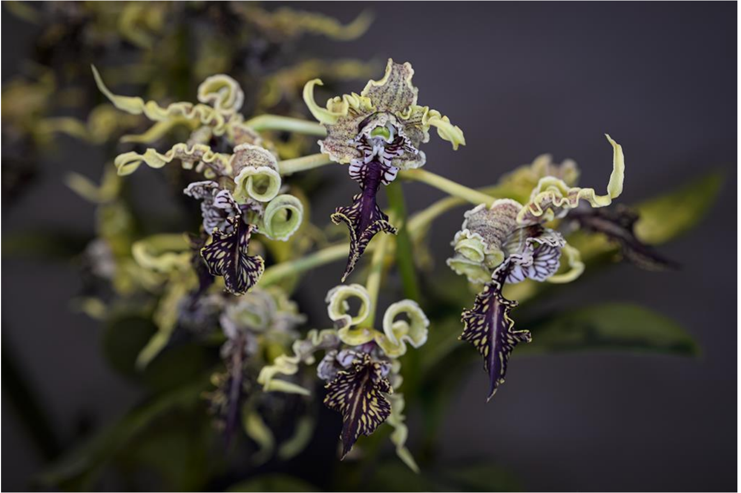
Den. spectabile