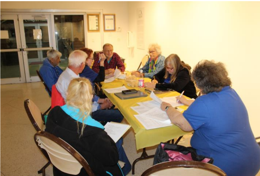
Our hard working Board of Directors, ... working hard. Doing whatever it is they actually do! ;) Hint.... They actually do quite a lot!