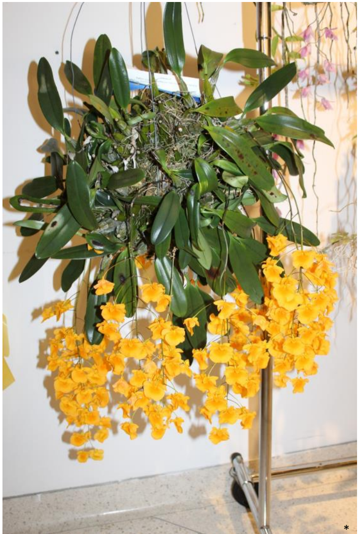
Den. aggregatum