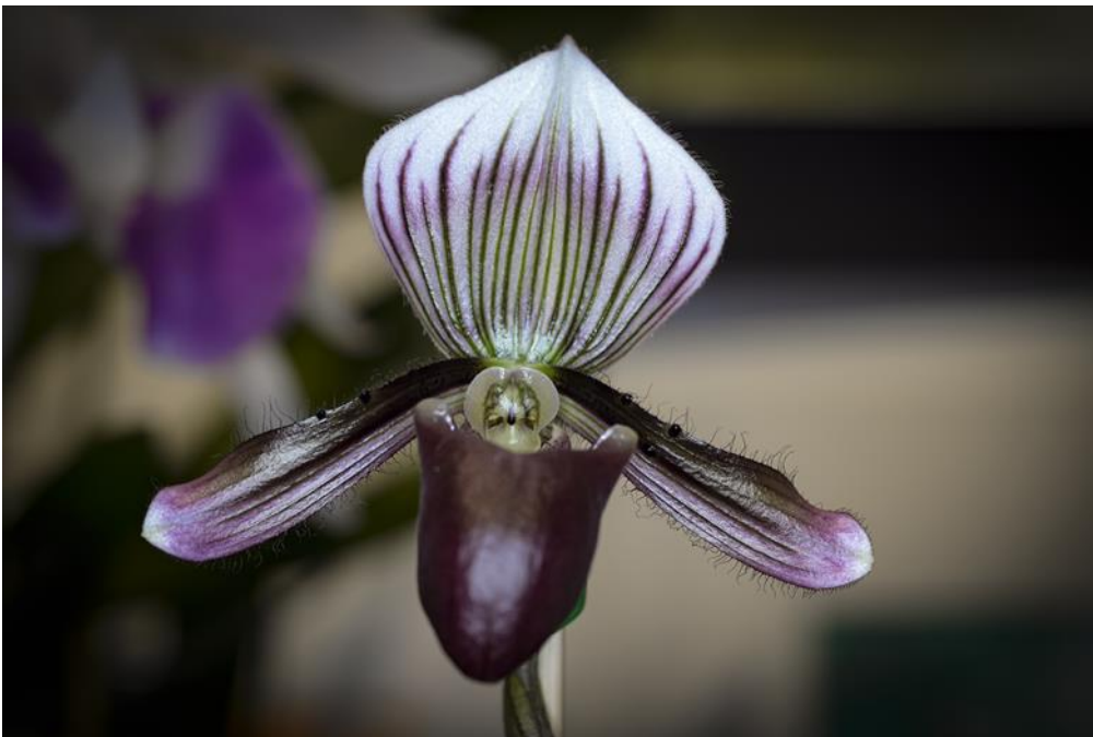
Paph. barbatum x sib - Lisa Coello