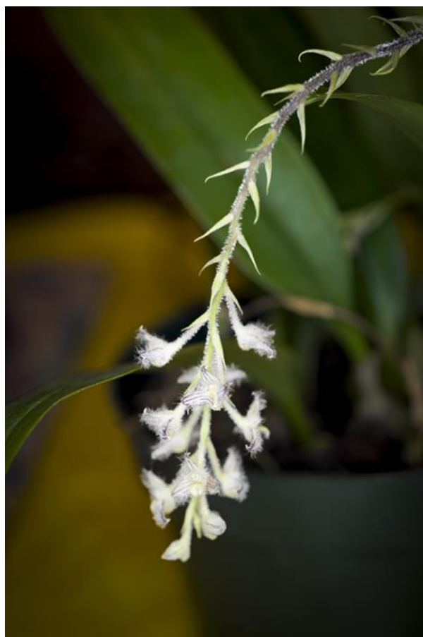
Bulb. lindleyanum - Javier Morejon