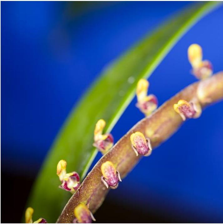
Bulb. maximum - David Foster