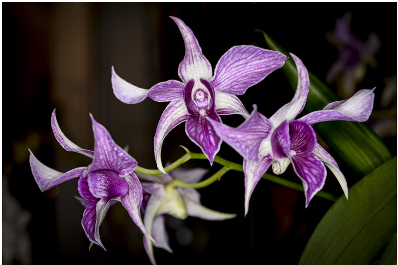
Den. Fire Wings - Virginia Benitez