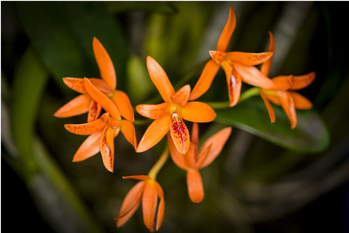
Gur. aurantiaca