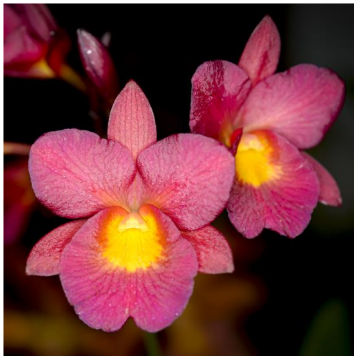
Den. goldschmidtianum