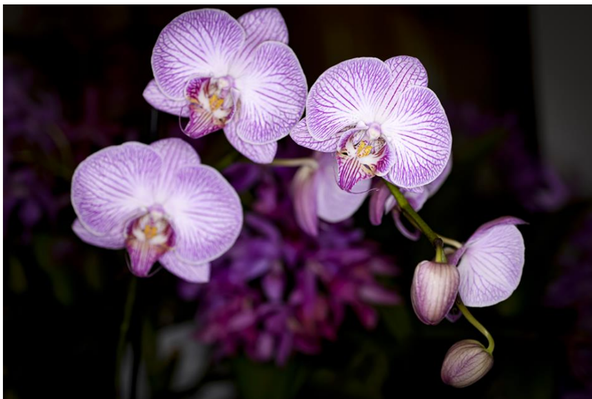
Phal. Charming Gem Stripes - Javier Morejon