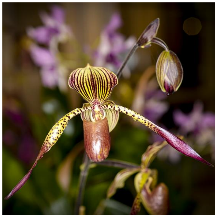
Paph. Julius - Pedro Bonetti