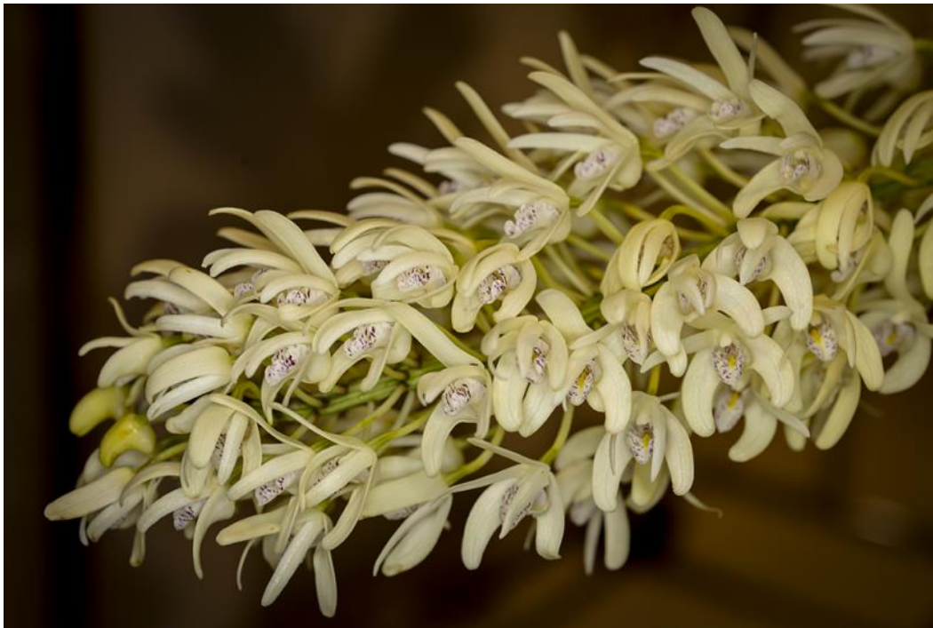
Den. speciosum