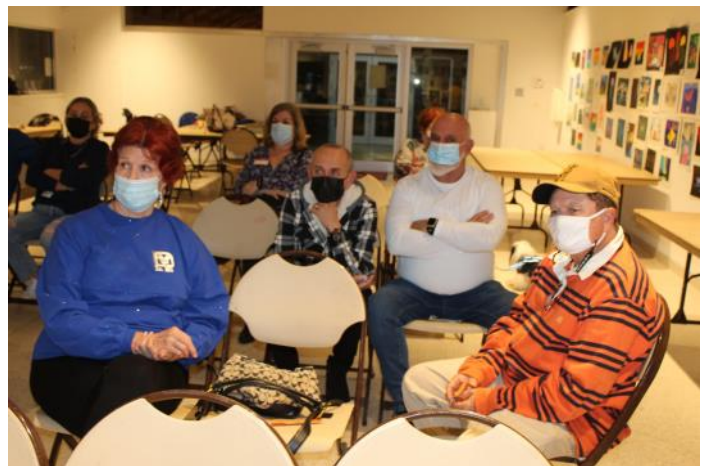
All of the photos in this series are courtesy of and © 2022 Annette Rodriguez