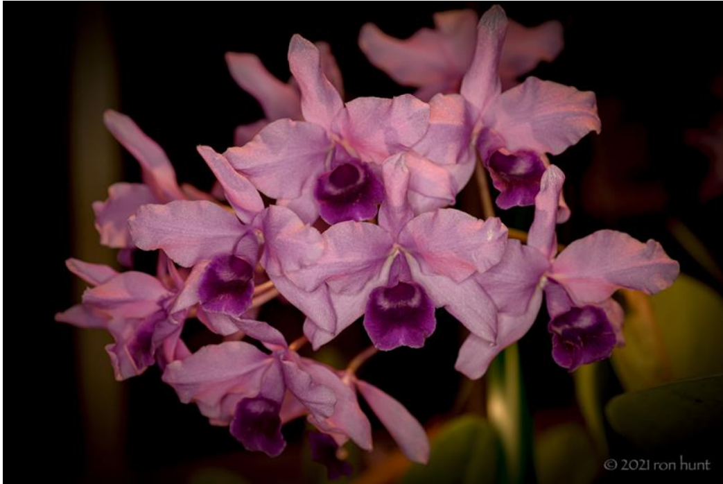
Guarianthe bowringiana