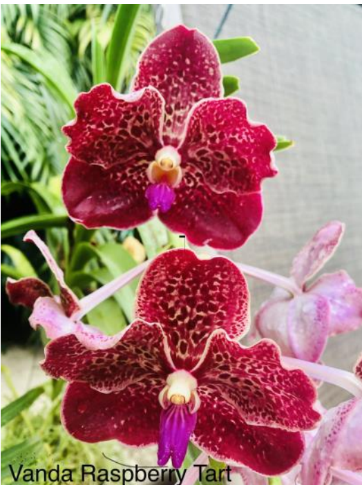
Vanda Raspberry Tart

As a result of not having to commute to work I've had a little extra time on my hands to nurture my orchids. As you might imagine, many of my orchids have been repotted, I've made new little balls of fertilizer using pantyhose for my vandas and I've been rewarded with many blooms during these weeks of quarantine. I'm especially excited about my constant bloomer, Vanda Corneels Ciller's Raspberry Tart (V Doctor Anek x V Mimi Palmer), picture attached. I miss all of my orchid friends more than you'll ever know and I'm looking forward to resuming our orchid activities as soon as it is safe to do so. Stay safe, stay healthy and wear a mask to keep others safe and healthy!