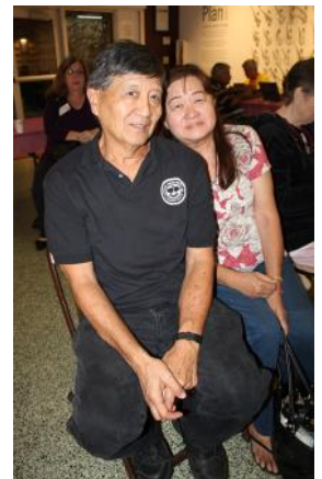
All photos on this page are courtesy of and © 2020, Annette Rodriguez. Thanks Annette!