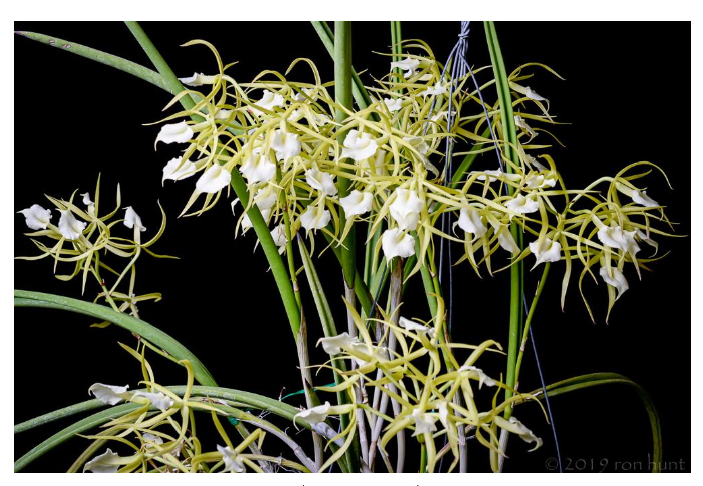
Brassavola perrinii