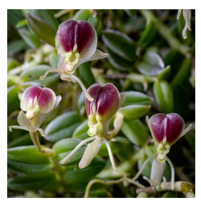
Epidendrum porpax