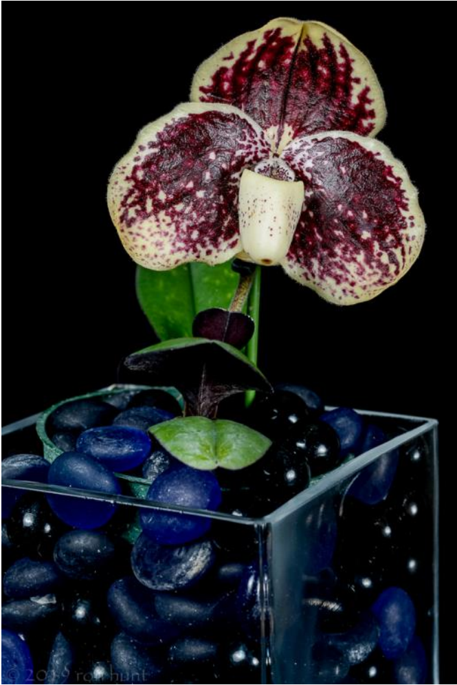
Paph. leucochilum ('Butterfly Wing' x 'Yukochi 2013') Pedro Bonetti