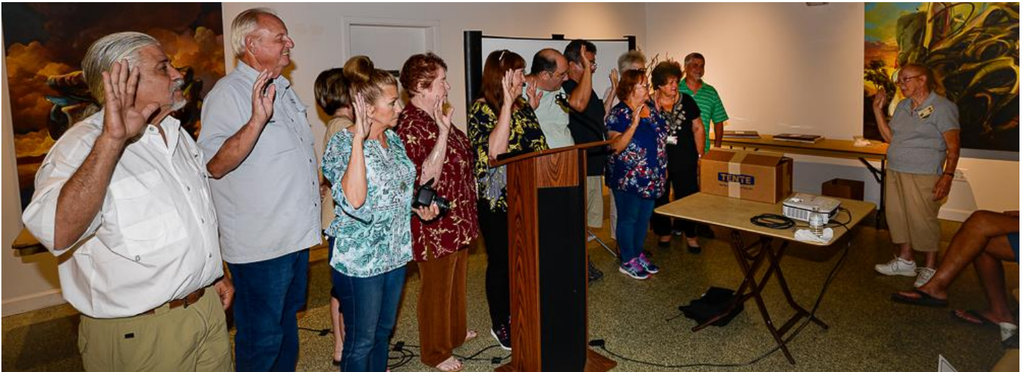
Getting down to business! We got ya now!