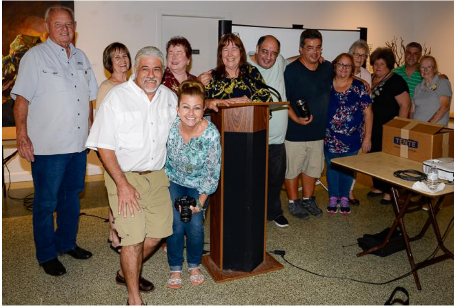
Incoming Officers and Board members before getting down to business!