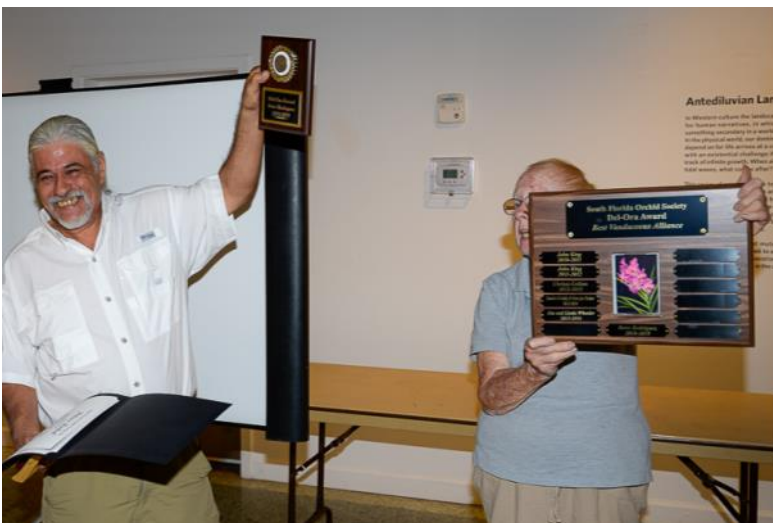
Why is this man smiling?

Orchids for the raffle table will be provided by OFE Orchid Supplies.