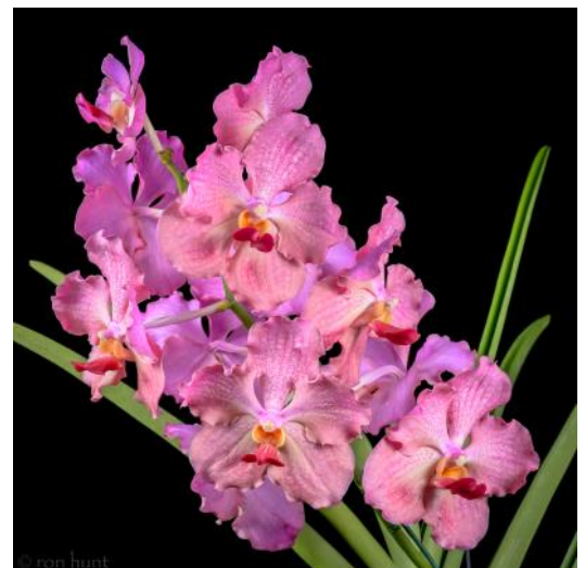
Could this be the reason?