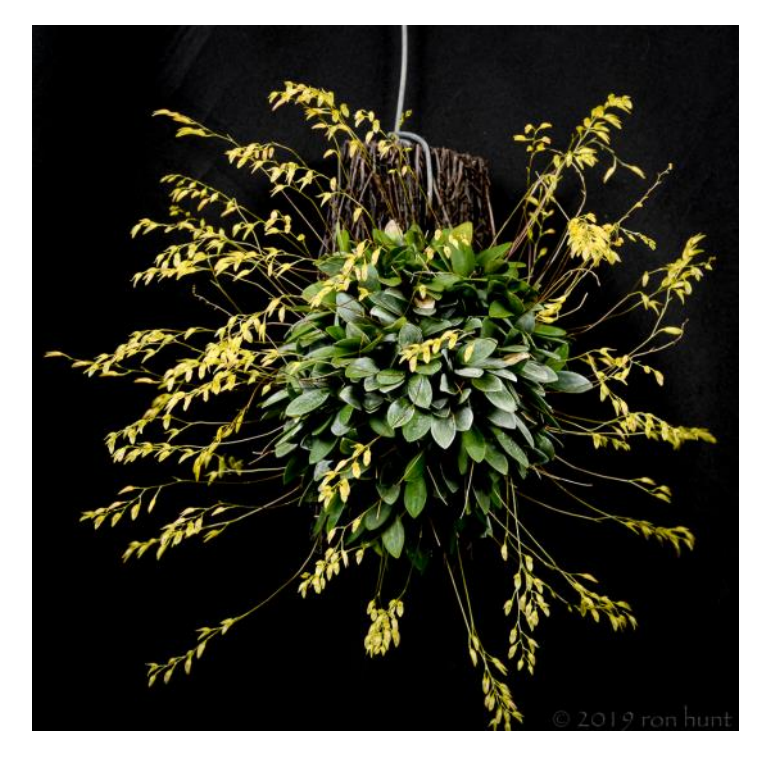
Pleur. grobyi