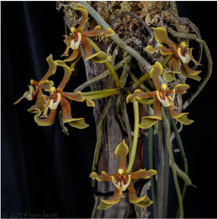
Paraphal. labukensis