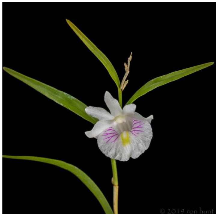
Den. linearifolium