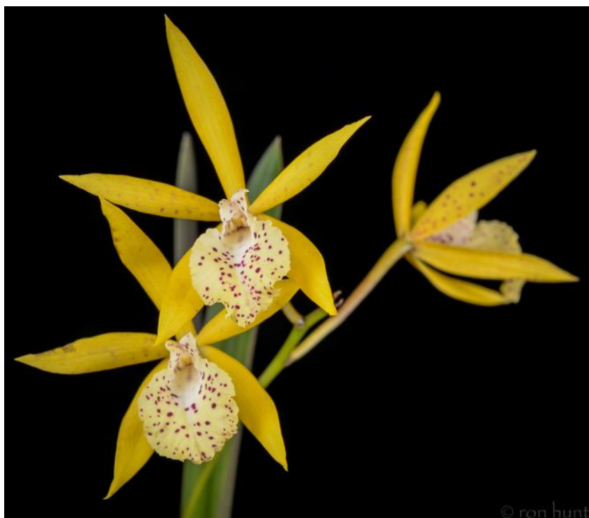
Encyleyvola Jairak Canary 'Yellow Star' - Lisa Coello