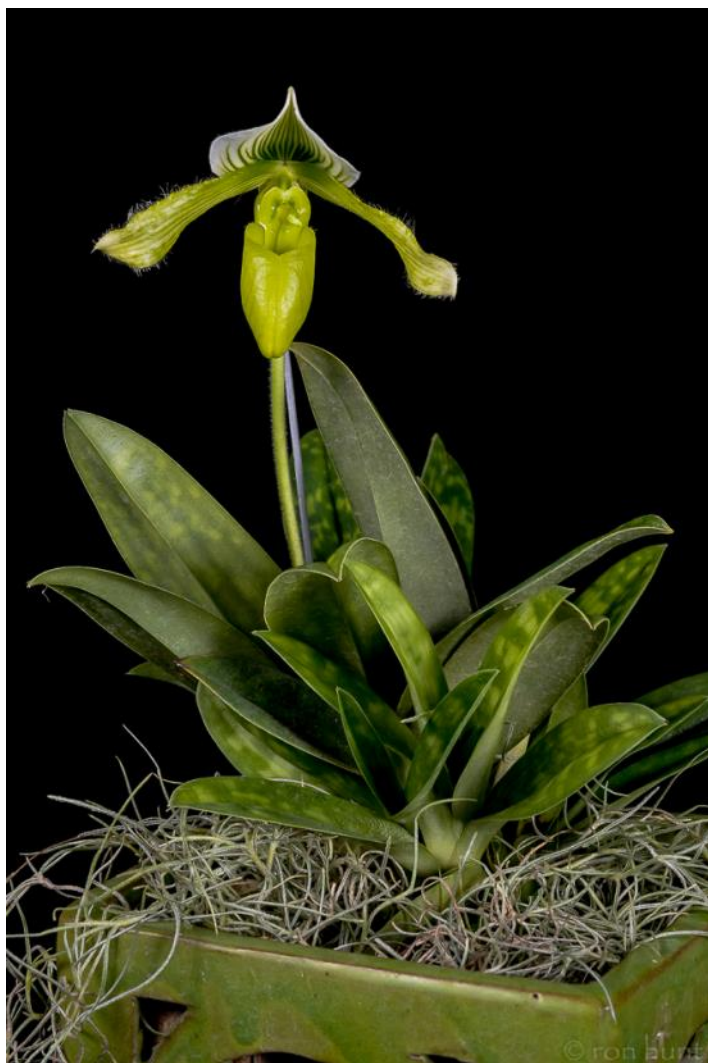
Paph. Mystic Jewel