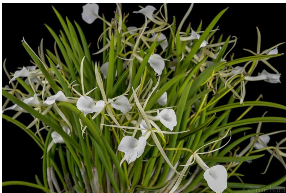
Brassavola nodosa 'Mendenhall'