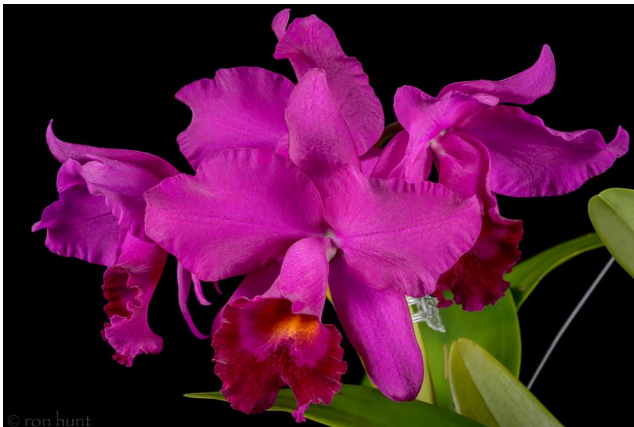
Cattleya Penang 'Black Caesar' AM/AOS — Lisa Coello