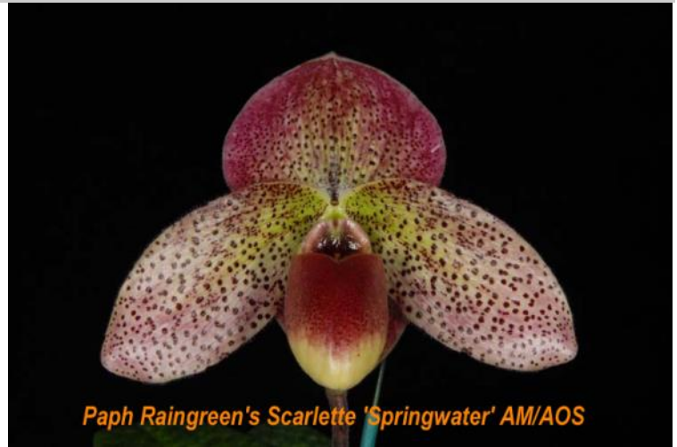
Paph Raingreen's Scarlette 'Springwater' AM/AOS

customers and colleagues. His passion in paphs resulted in numerous award winning plants and an on-going paph breeding program using local lab work, and local growing environment. His goals are to bring the excellence of a paphs breeding program back to America, and augment the enthusiasm of paph growing by way of sharing his growing experience and educational programs via shows and society speeches. You will see these goals reflected in his breeding program with well thought process to target various audiences; from easy growing/flowering plants to state of the art breeding catered to the most difficult collectors' interest, in parallel with conservation of breeding species, improving overall plant and flower quality, broaden their growing conditions to make growing paphs a joy, not an aggravation!