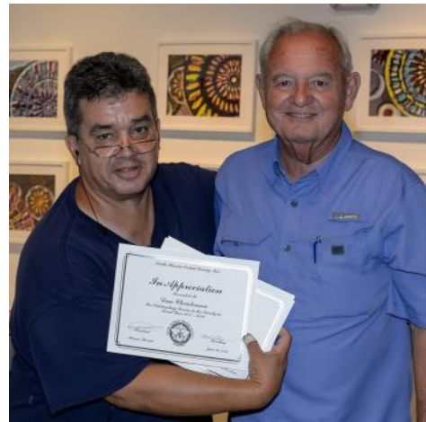
Certificates of Appreciation to our intrepid board members and volunteers