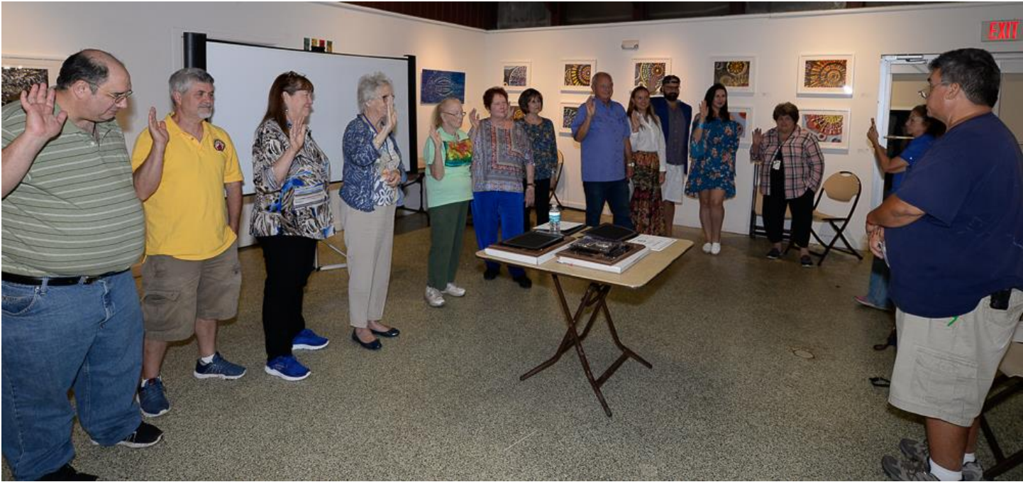
Swearing in of our new officers and board members for the coming year!