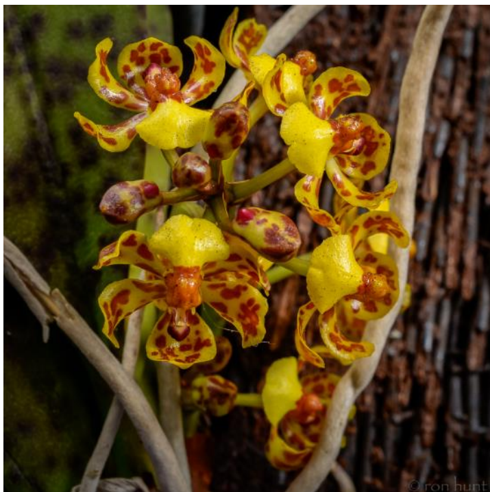
Ctna. Once Again 'Talia" - David Foster