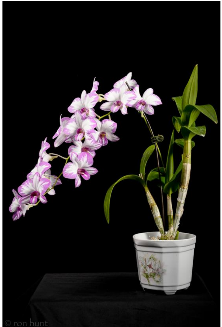
Den. Enobi Purple 'Splash' AM/AOS - Christa Collins