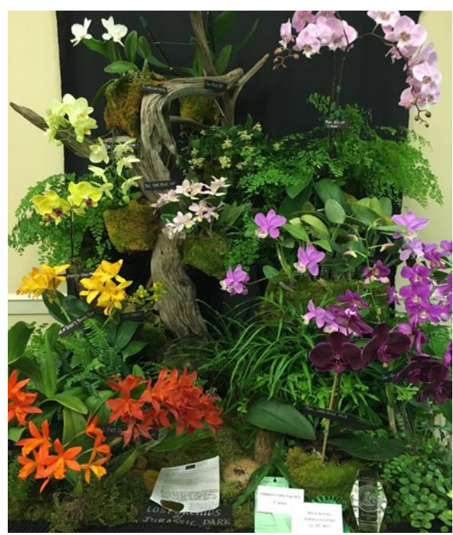
Individual entry at Gulf Coast Orchid Alliance Naples Orchid Show

Our orchid auction this past February 21<sup>st</sup> was a great success. Anybody who wanted to bid, was able to take orchids home. We made about 20% more than last year. Regretfully, we had