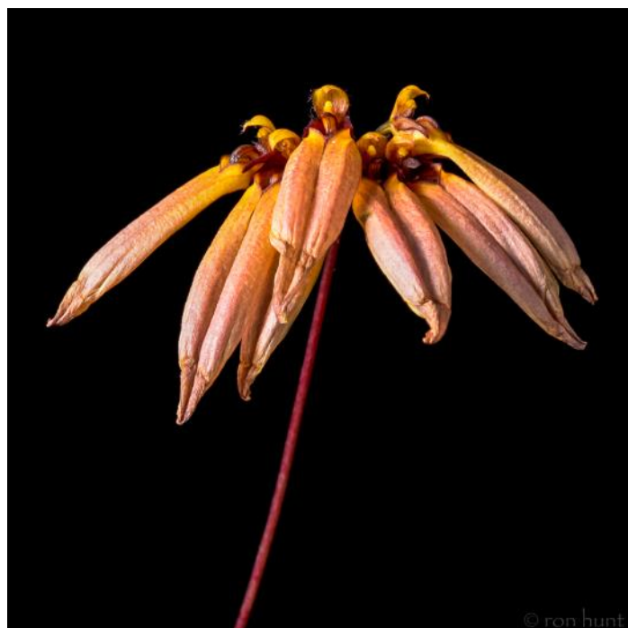
Bulb. mastersianum - Javier Morejon