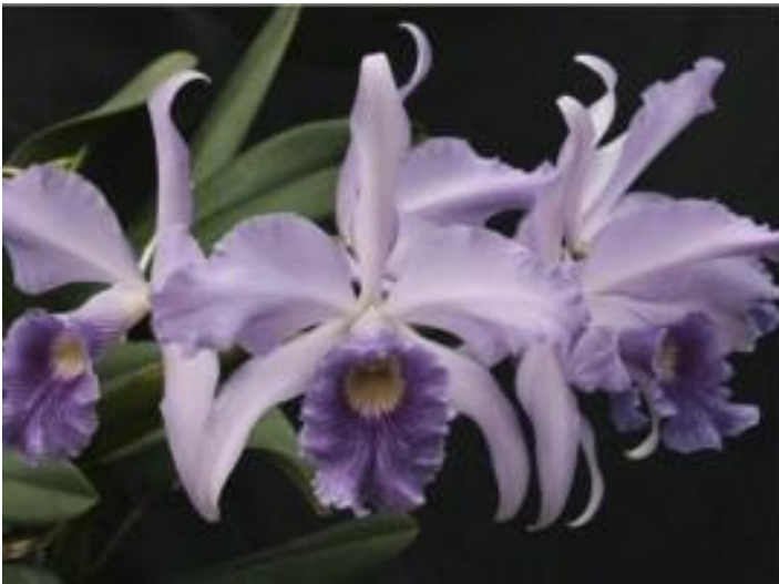
Lc. Canhamiana var. Coerulea 'Azure Skies'