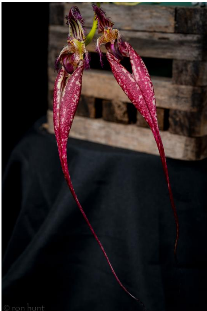
Bulb. Doris Dukes