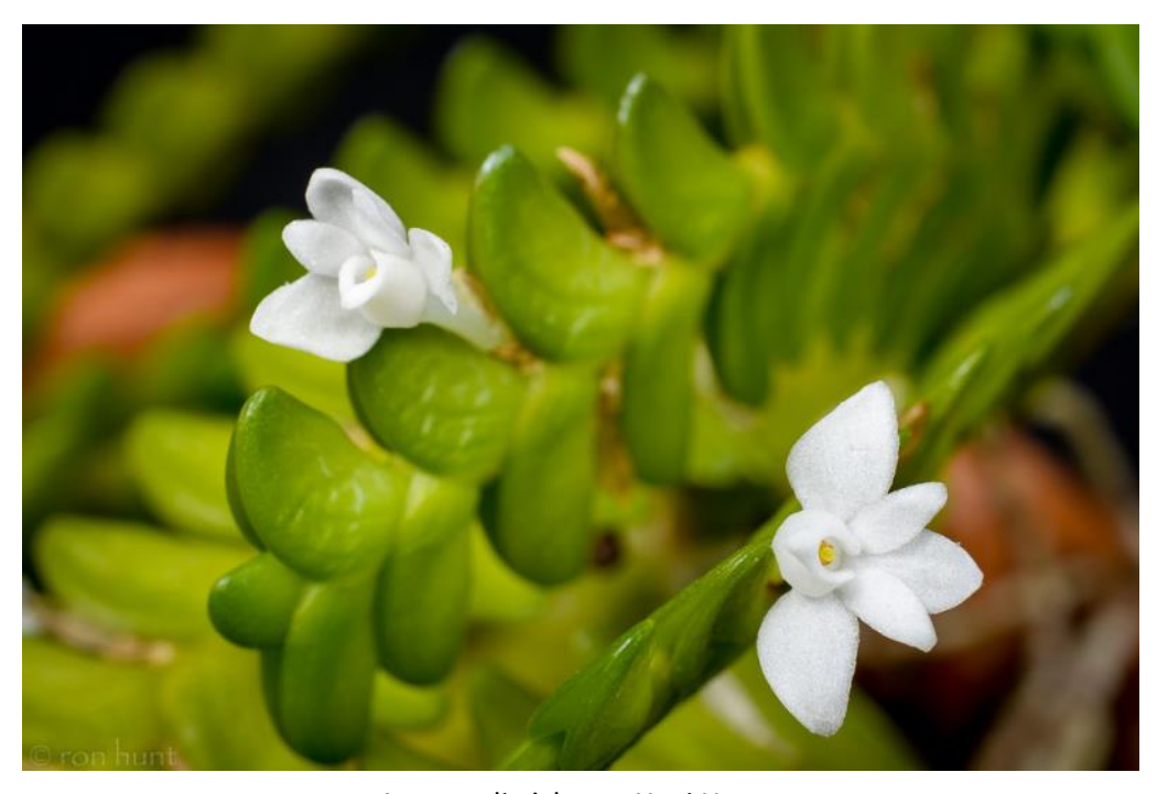
Angcm. distichum