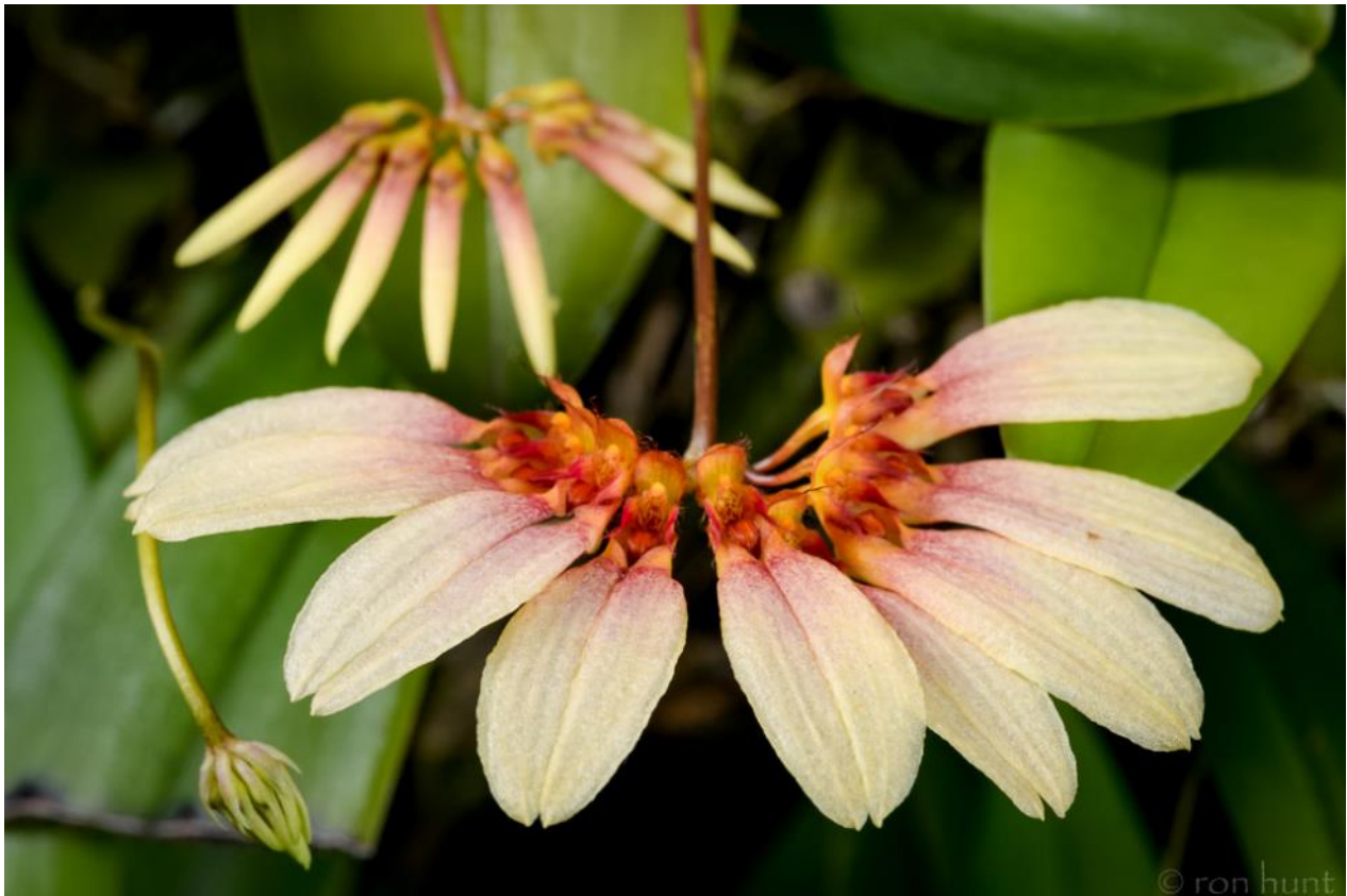
Bulb. makoyanum