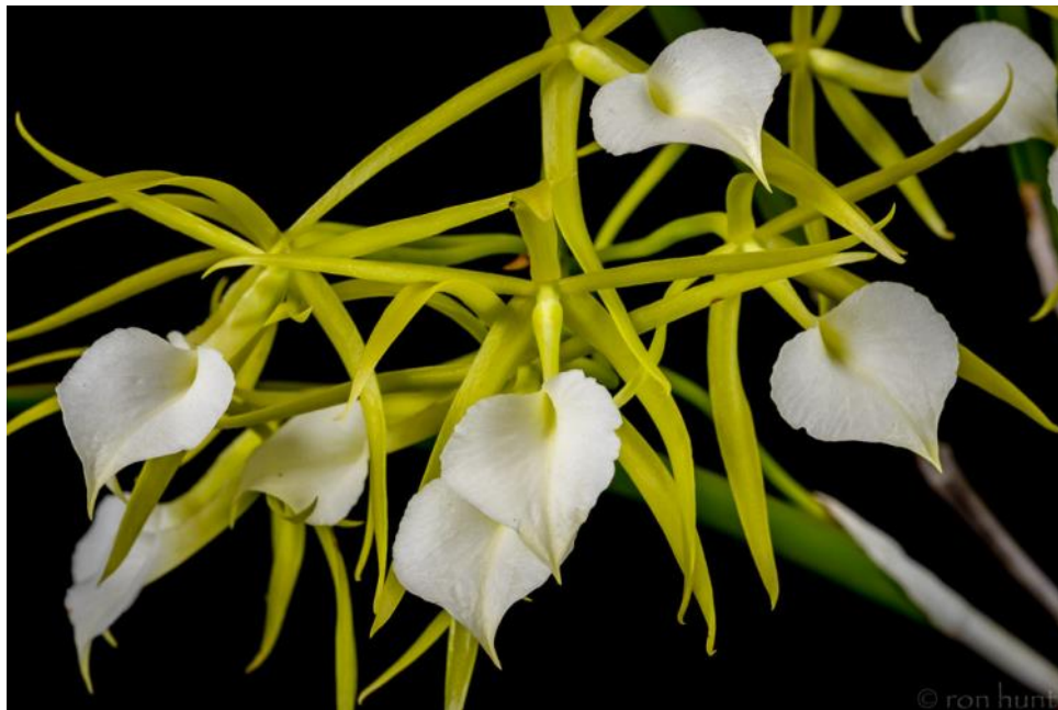
B. cordata