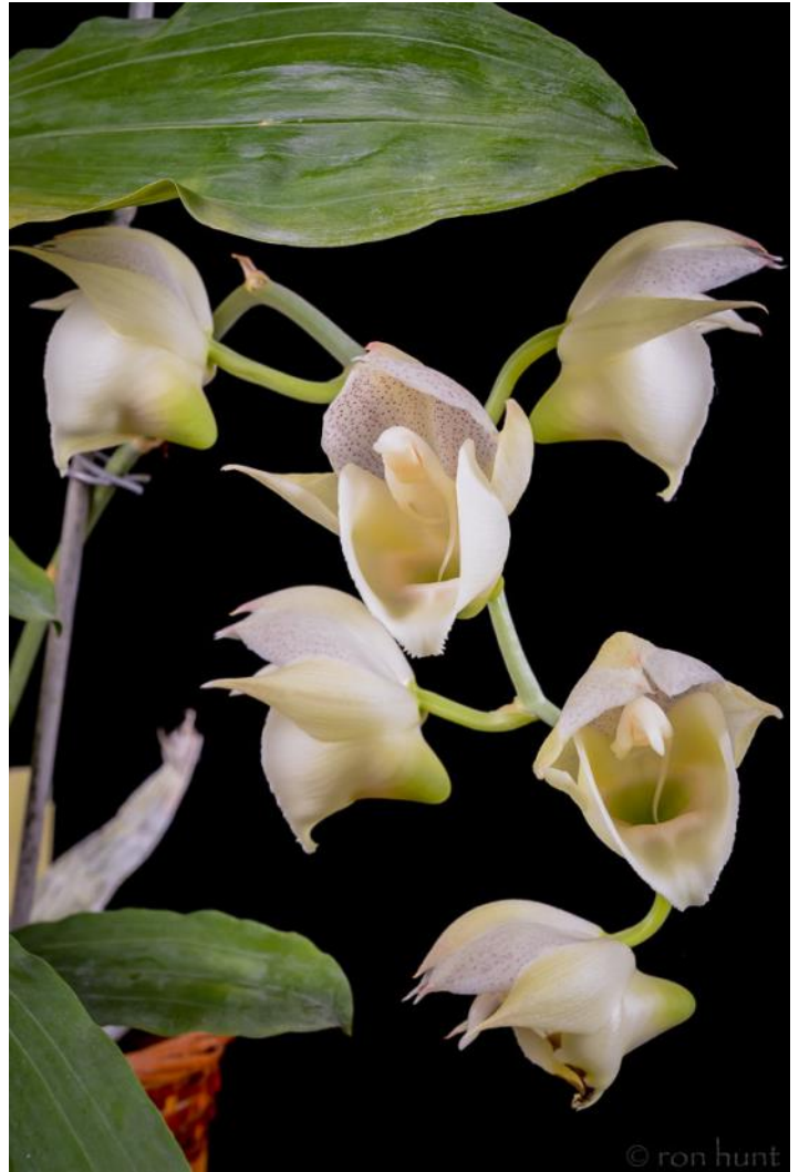
Catasetum tapiriceps (natural hybrid of macrocarpum x pileatum ) - Sandy Schultz & Georgia Tasker