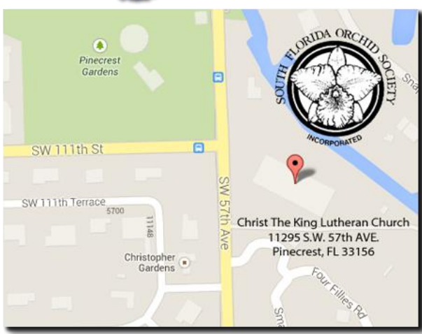
Please Join Us at Our New Meeting Location Christ The King Lutheran Church 11295 S.W. 57th AVE Pinecrest FL 33156