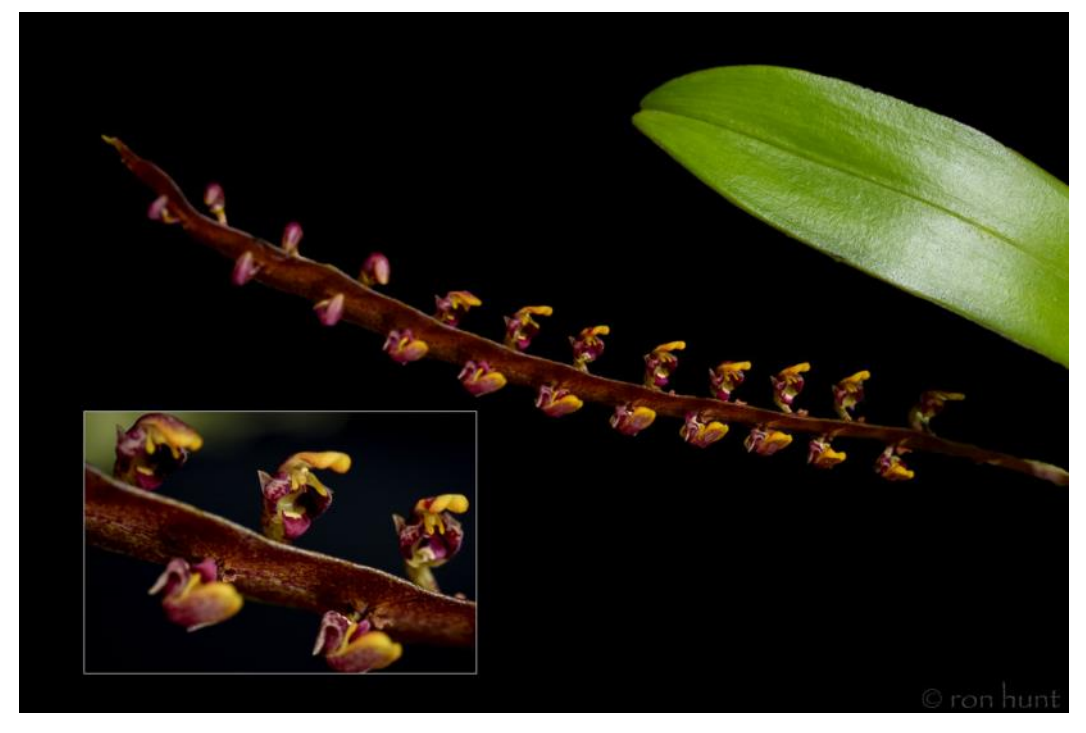
Bulb. falcatum