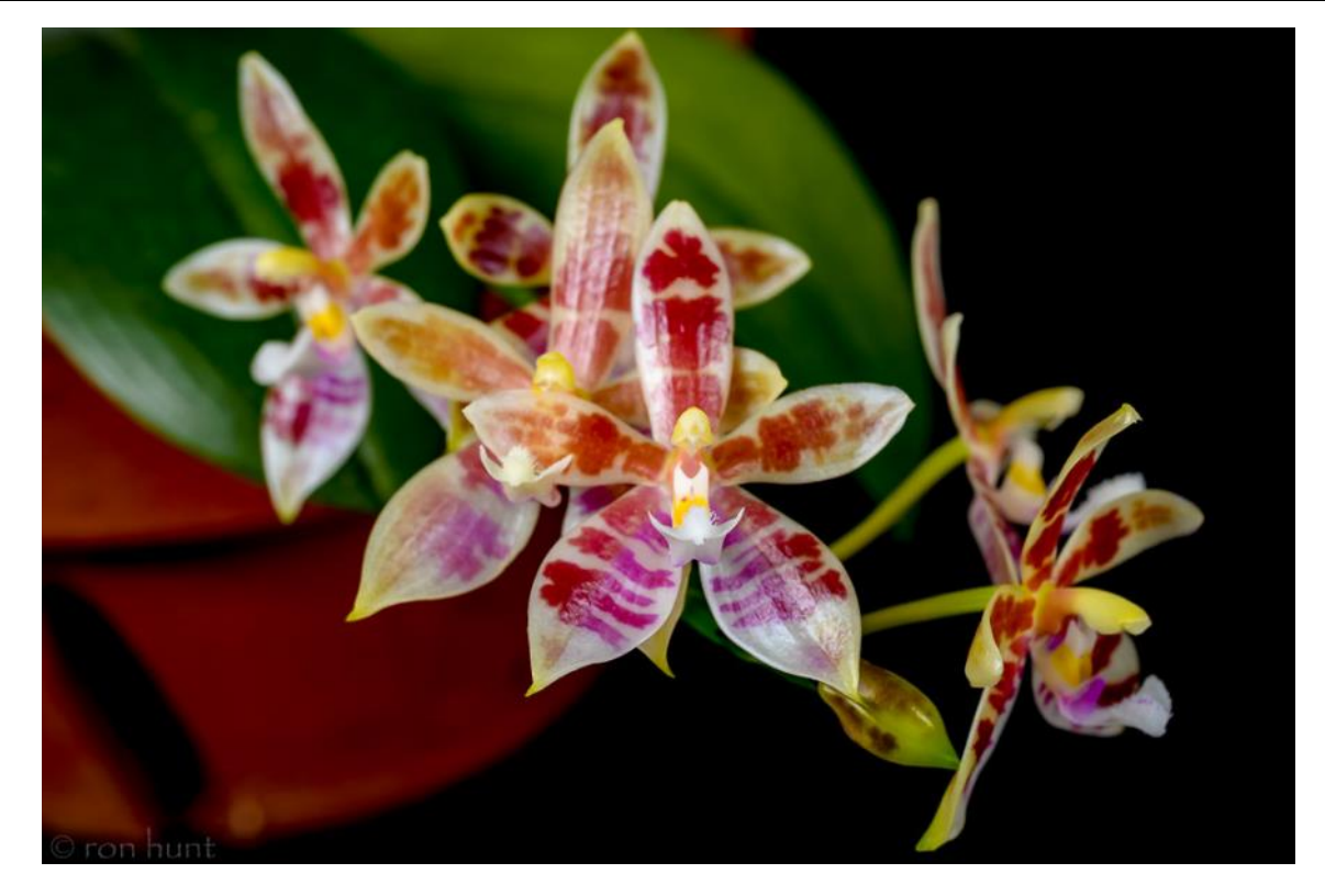
Phal. tetraspis 'Classic Moonbeam' - Ralph Hernandez