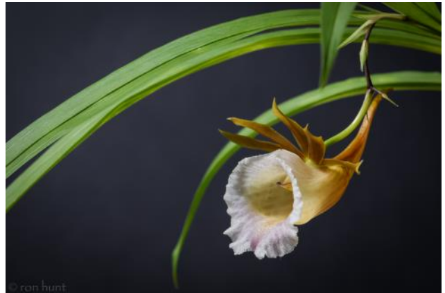
Galeandra leptoceras

Make your plans now to attend... The South Florida Orchid Society fall 2015 show