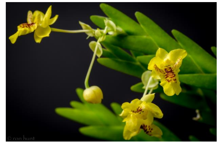
Lockhartia dipleura - Betty Eber