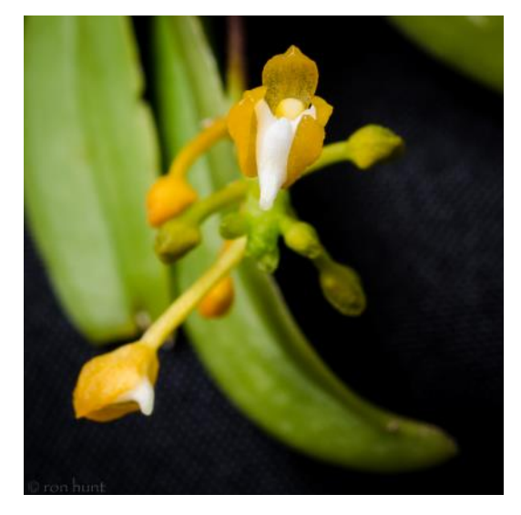
Ascochilus siamensis