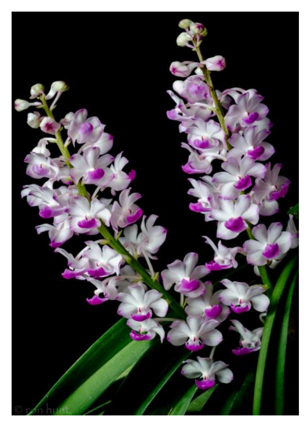
Rhy. celestis pink - Betty Eber