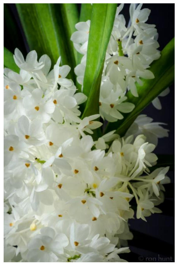
Asctm. ampullaceum v. album - Betty Eber