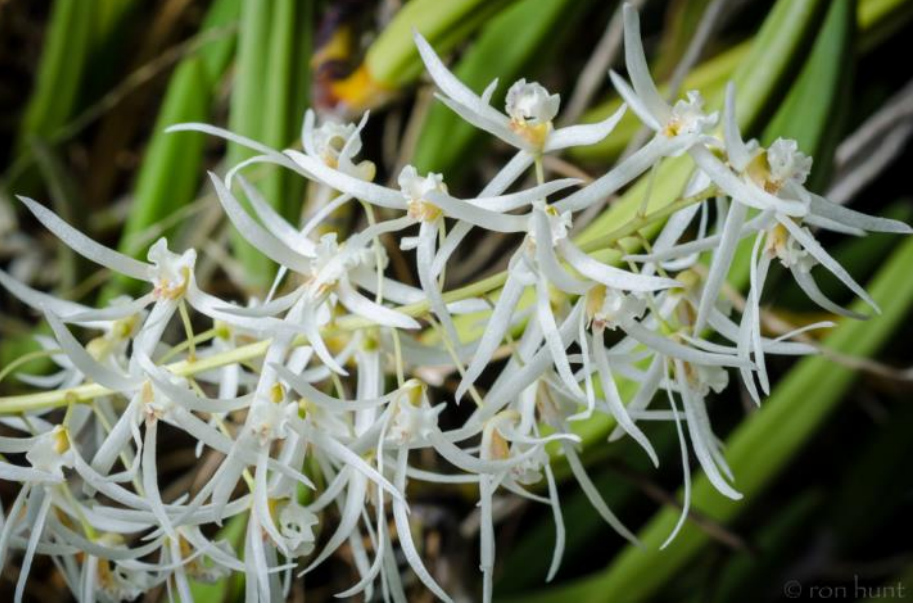
Den. wassellii