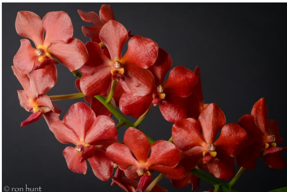
Ascda. Tavivat – Noelene Westman