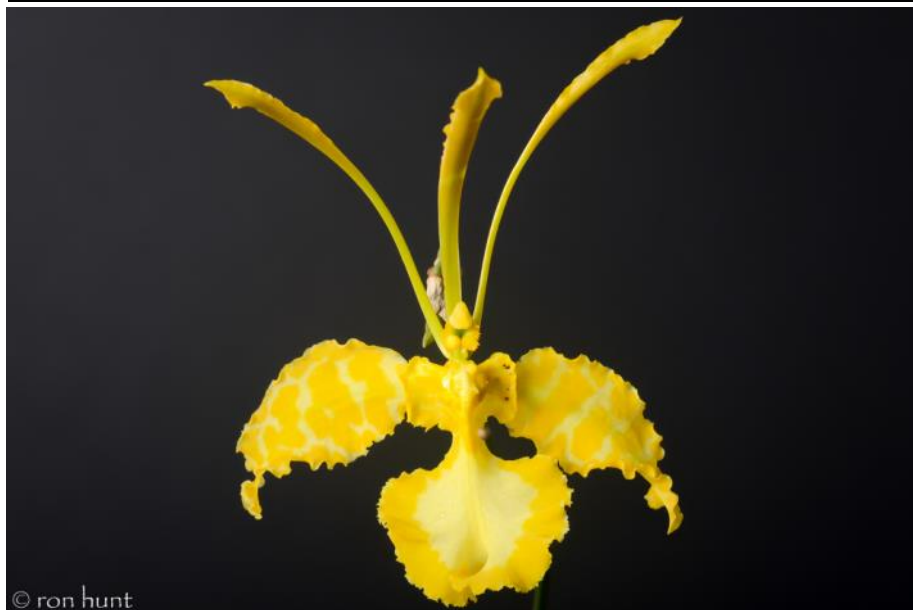
Psychilis Kalihi 'Crystal' -- Betty Eber