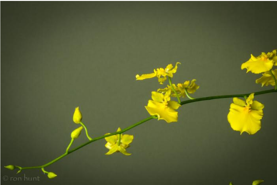
Onc. Lemon Heart 'Baby Face' Betty Eber