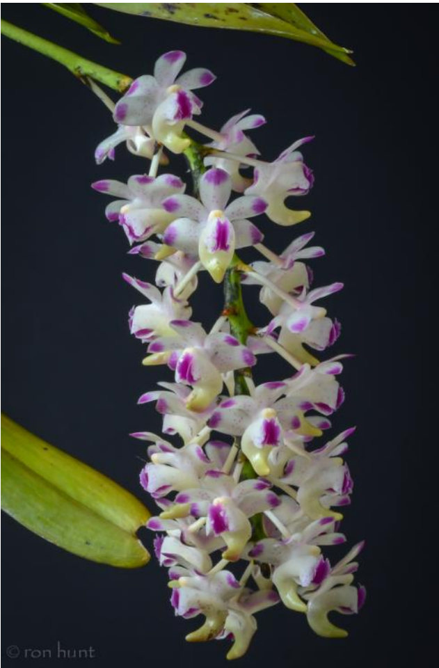
Aerides quinquevulnerum