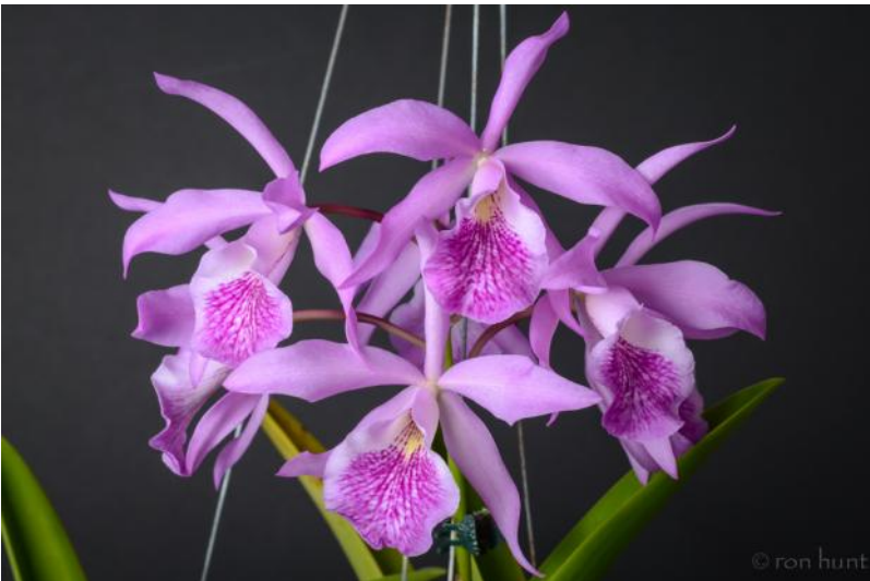
Brassocatanthe [Bct.] (syn. Bc.) Haleahi Profusion ( C. maxima × Bc. Maikai)