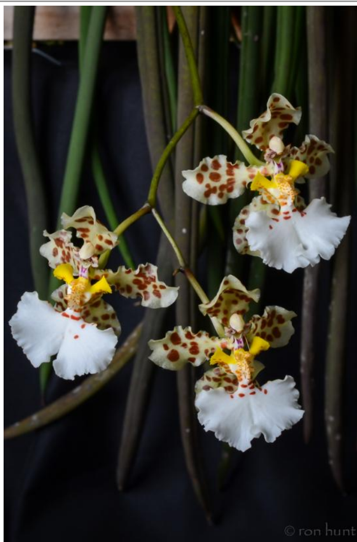
Trichocentrum jonesianum , Alfredo Figueroa