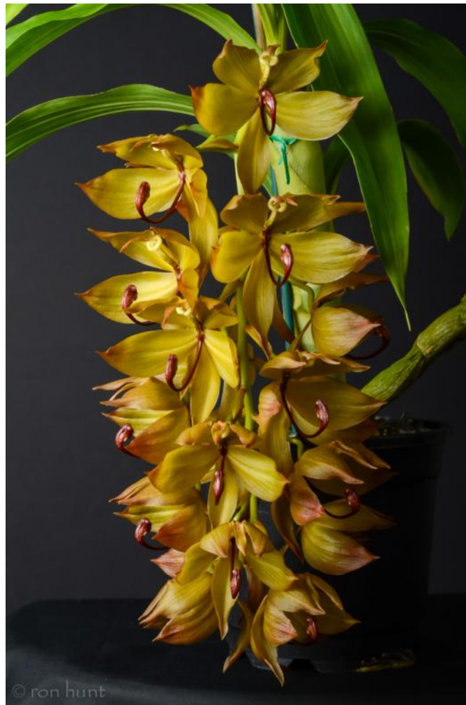
Cyc. cooperi