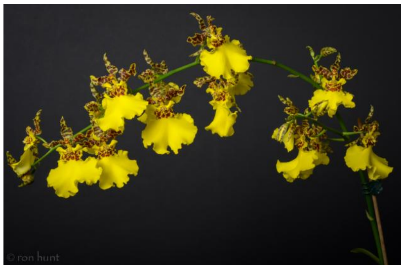
Onc. Jiuhbao Gold 'Tainan' AM/AOS, Alfredo Figueroa