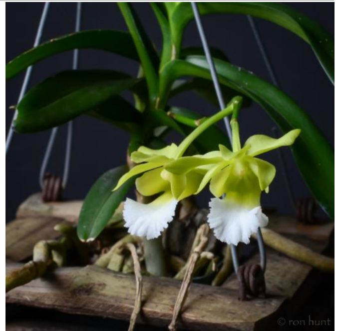
V. vietnamica - Jim Wheeler