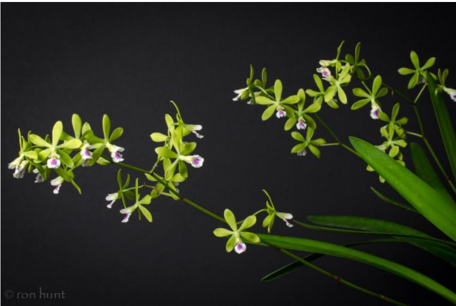
Epi. steinbachii x Enc. tampensis v. alba - Betty Eber