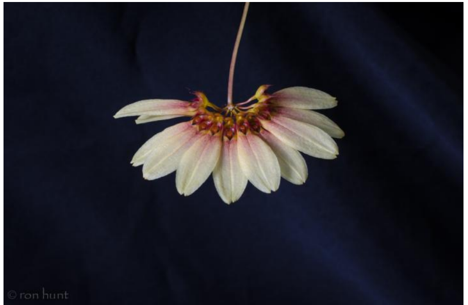
Bulb. makoyanum