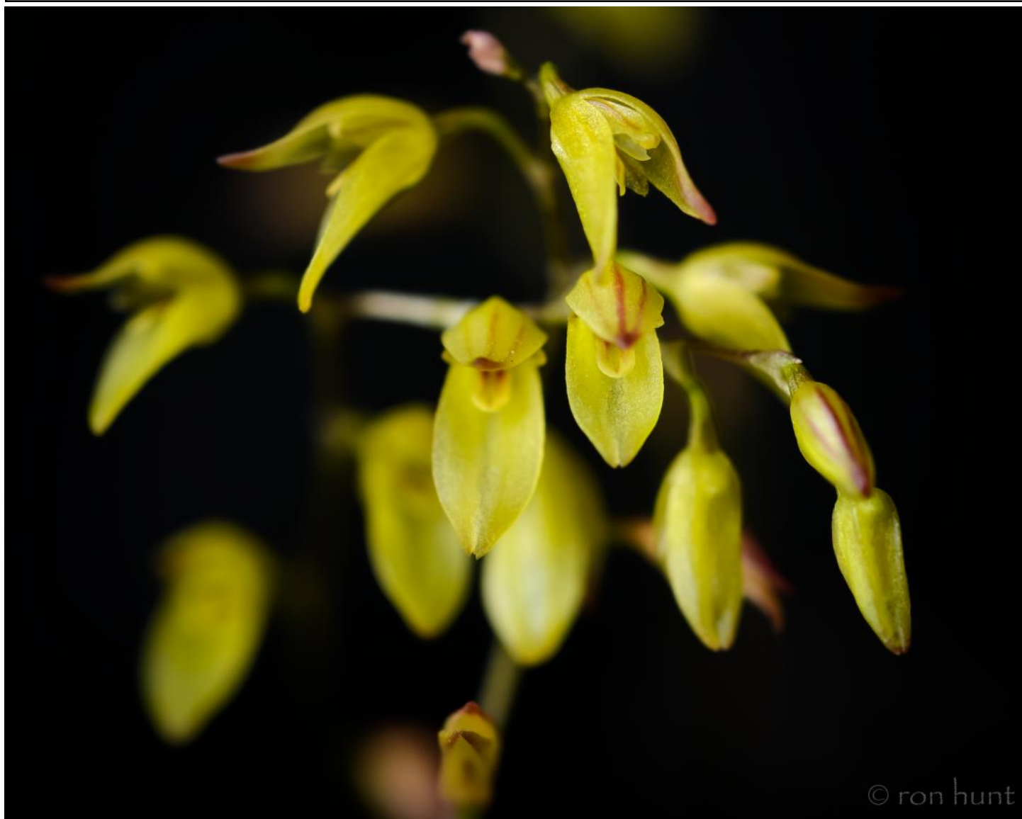
Pleur. grobyi