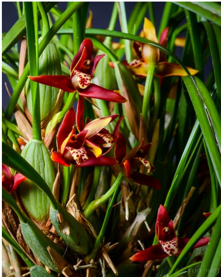
Max. tenuifolia