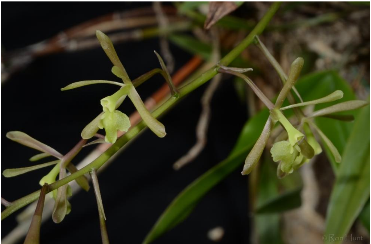
Epi. magnoliae (syn. conopseum ) — David Foster