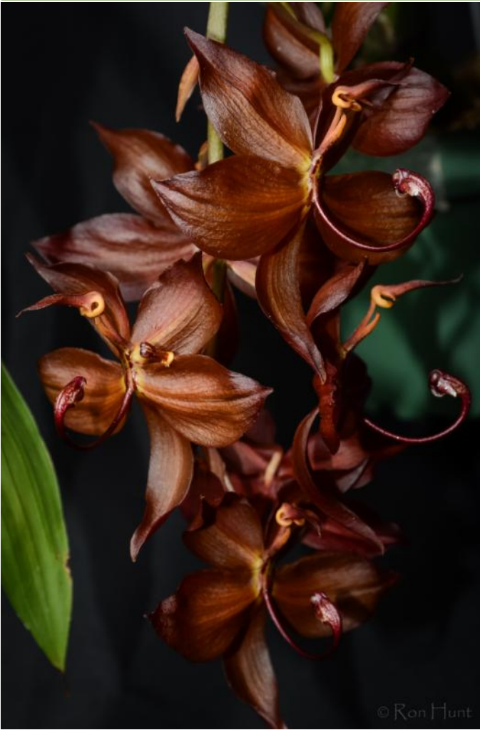
Cyc. cooperi ('SVO111' x 'SVO') — Jim Wheeler