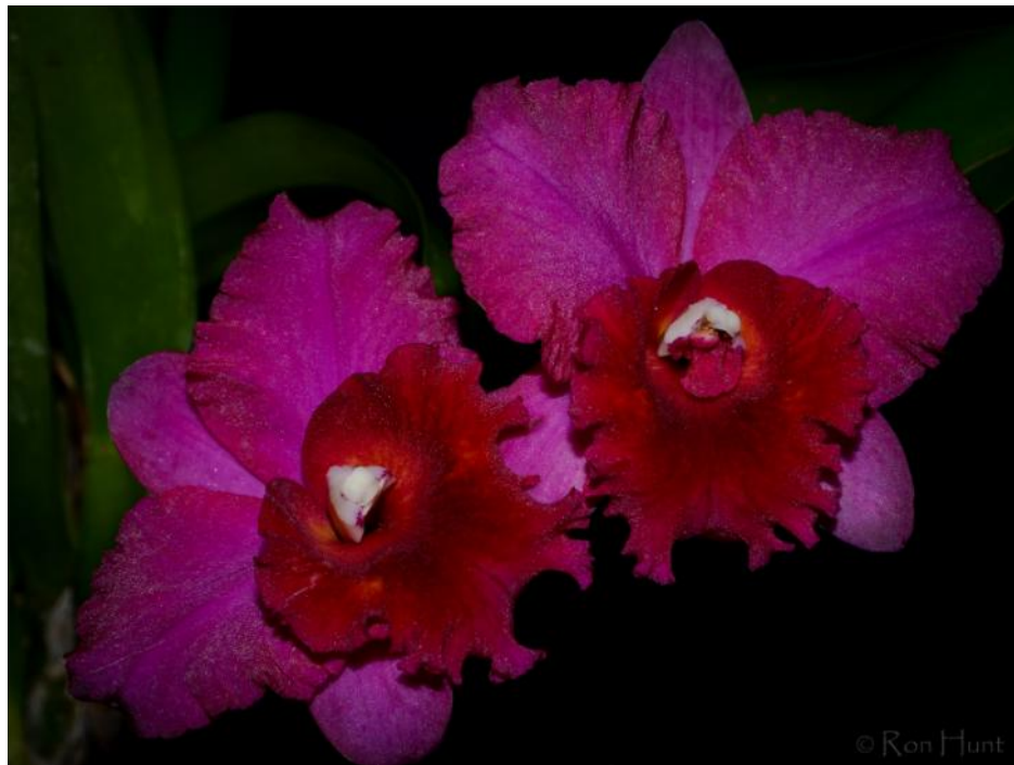
Pot. Elaine Taylor 'Krull Smith'