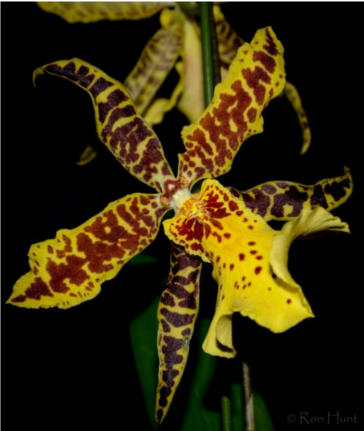
Alcra. Hilo Ablaze 'Hilo Gold' HCC/AOS Pedro Bonetti