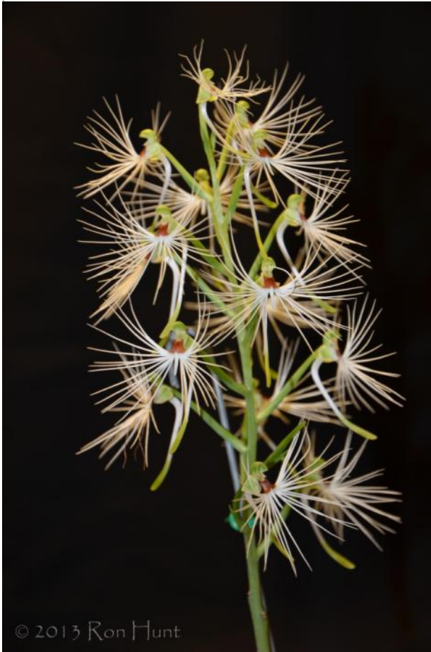
Habenaria medusa