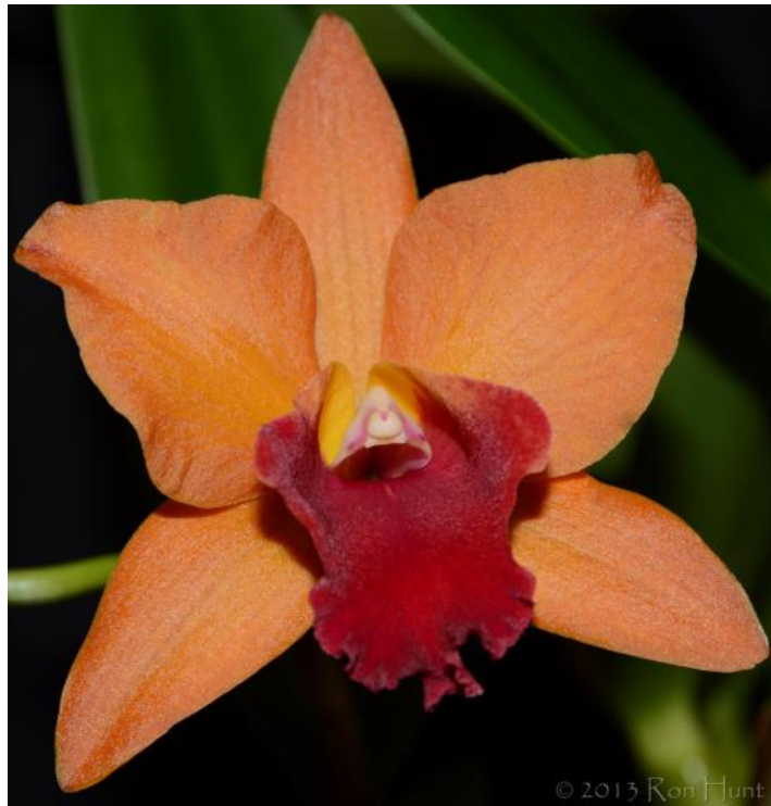
Lc. Little Fortune 'Fiery' — Pedro Bonetti