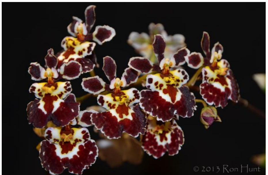
Tolumnia Jairak Firm Regina Mendoza