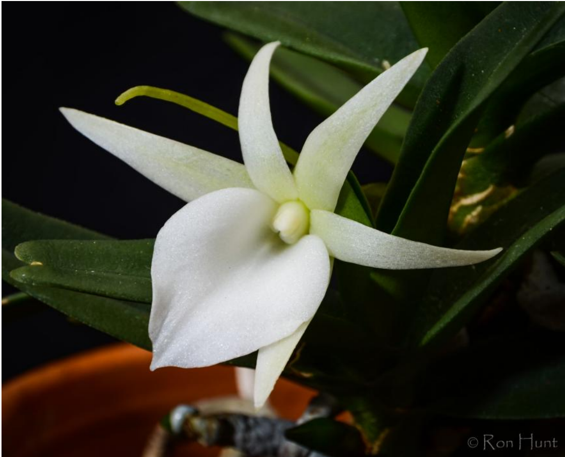
Angraecum didieri - Pedro Bonetti