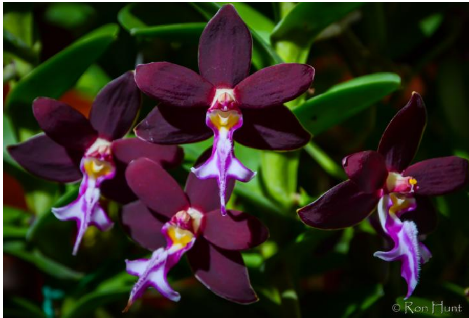
Trgl. philippinensis v. brachiata