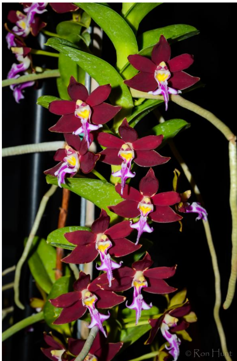
Trgl. philippinensis v. brachiata