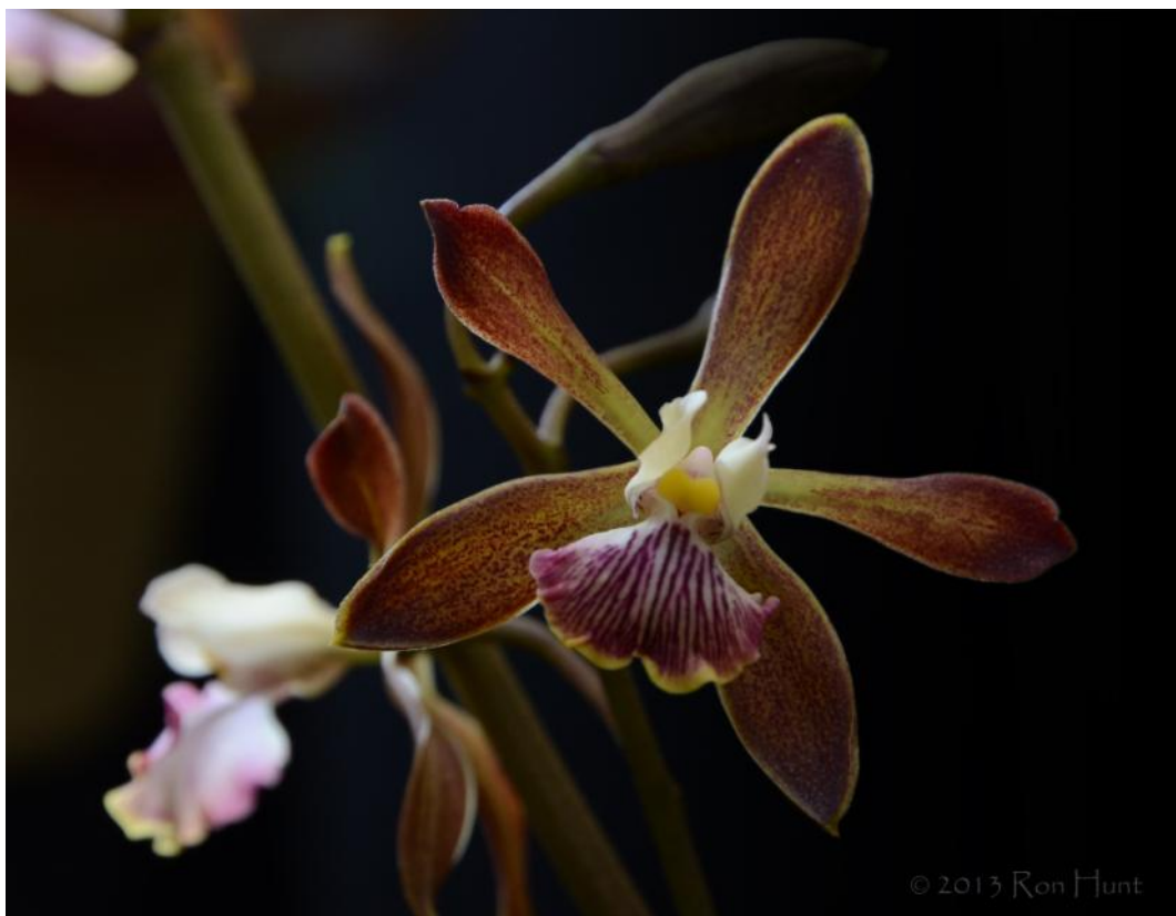
Epi. Orchid Jungle