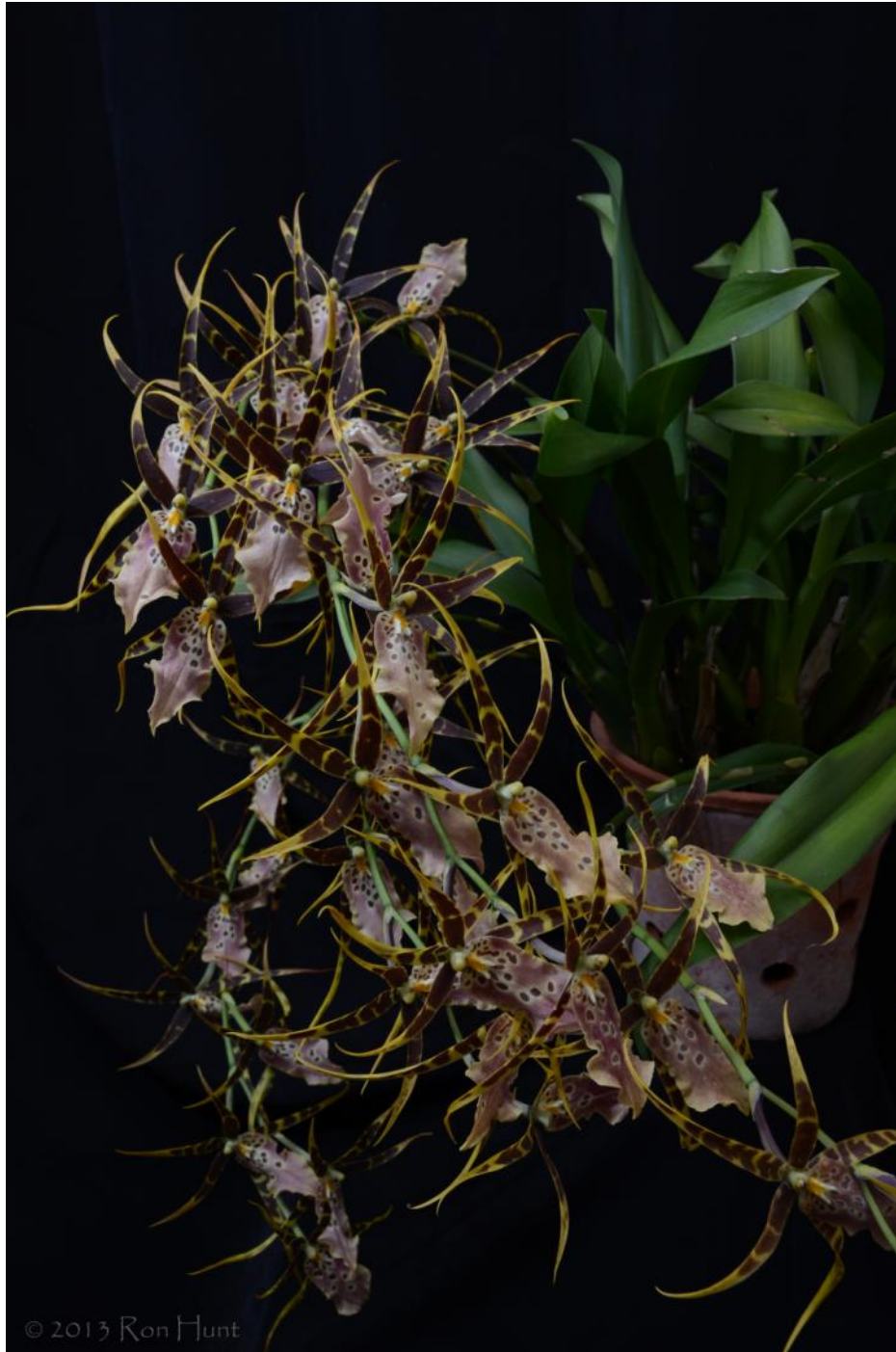
Mtssa. Shelob 'Tolkien' — Pedro Bonetti