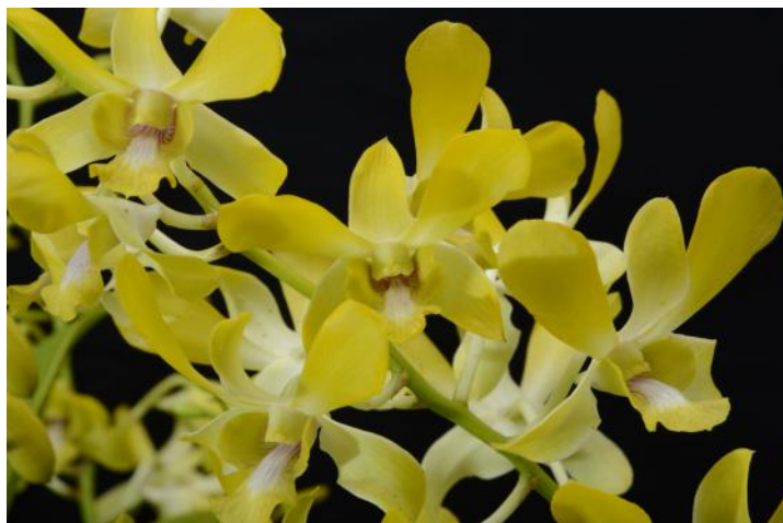
Den. Waianae Profusion x Chaisiri Gold