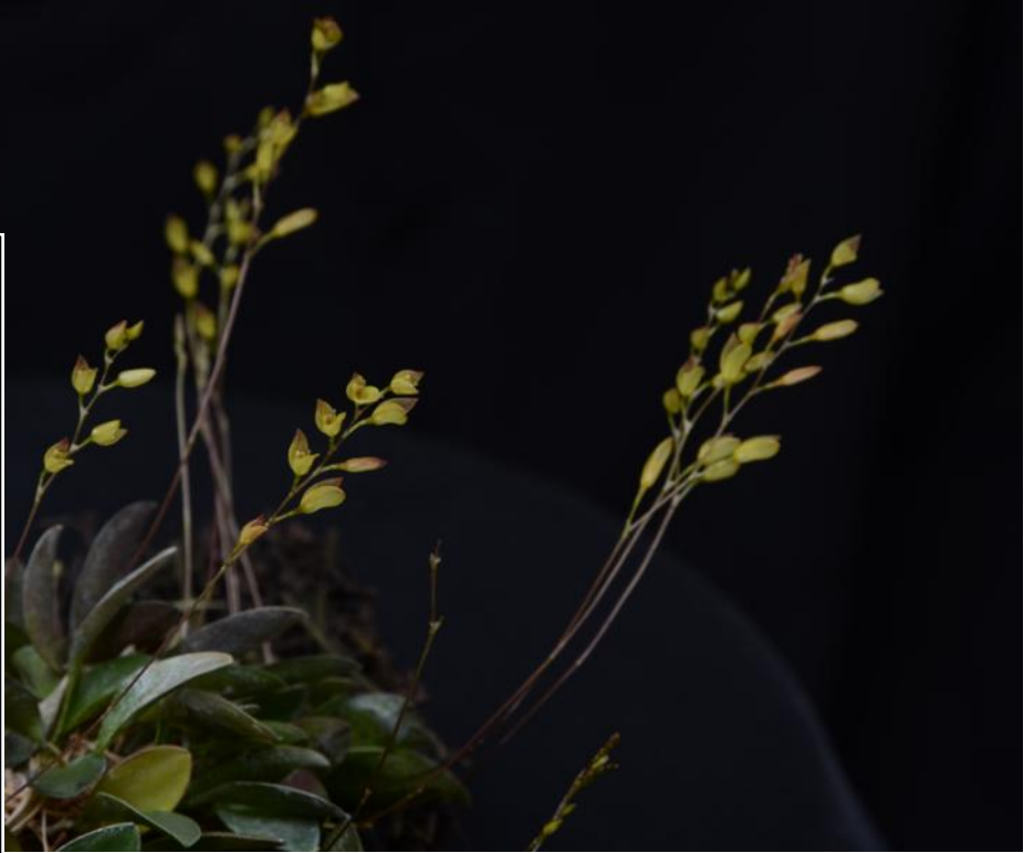
Pleur. grobii