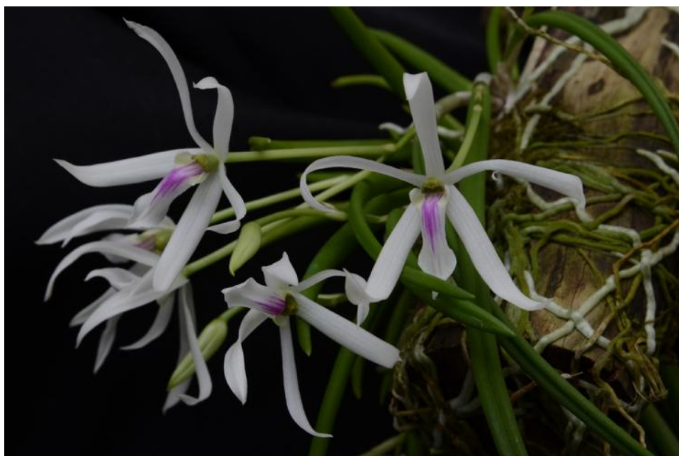
Leptotes bicolor — Betty Eber