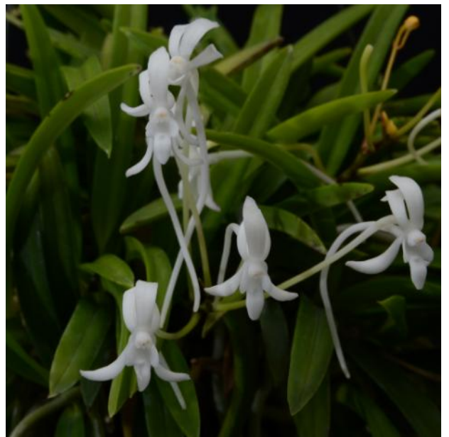
Neofinetia falcata