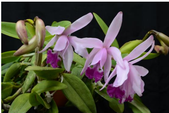
C. intermedia — Pedro Bonetti