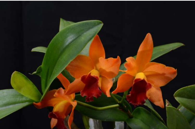
Lc. Little Fortune 'Fiery' — Pedro Bonetti