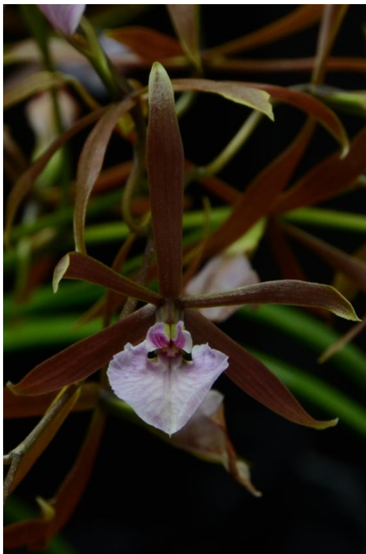
Enc. bractescens — Pedro Boretti