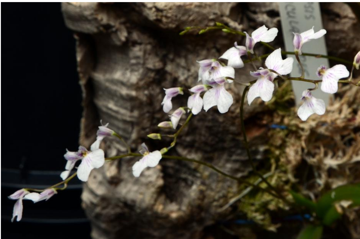
Ionopsis utricularioides