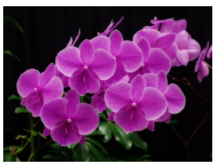
Pink Phalaenopsis Trophy Winner Phal. Kull's Butterfly exhibited by Krull Smith Landscapes, Inc.