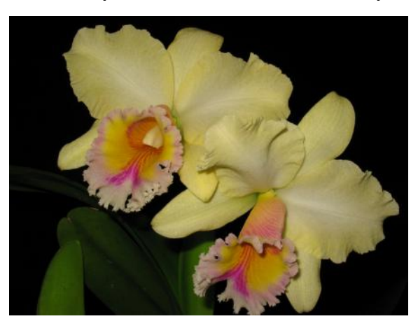
Blc. George King 'Southern Cross' - Marcy Prince