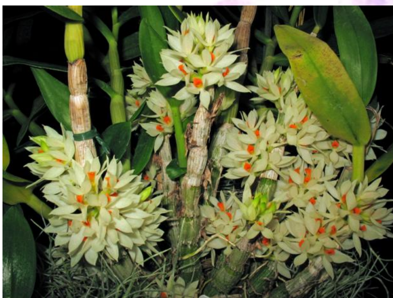
Den. bracteosum—Gladys Roudel