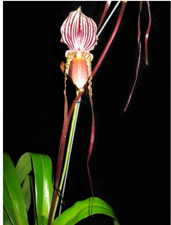
Paph. philippinense X Paph. Hsinying