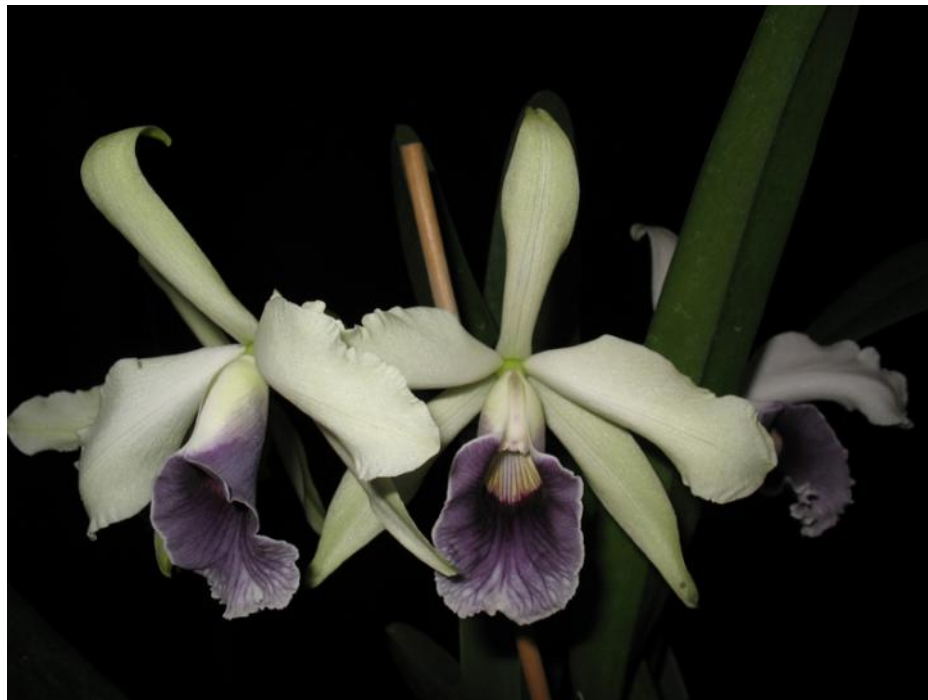
L. purpurata var. werckhauseri "Blue Sky"—Betty Eber