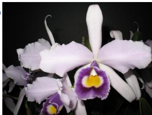
Lc. Blue Koi X Lc. Wora—Lore Wigley